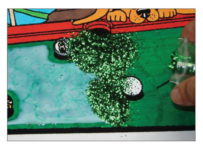
Fill a further section with glue, joining onto the previous one (right).

Then fill in the middle. Drag and spread the glue using the nozzle (above left). Make a "bed" of glue for the glitter to sink into (above right).