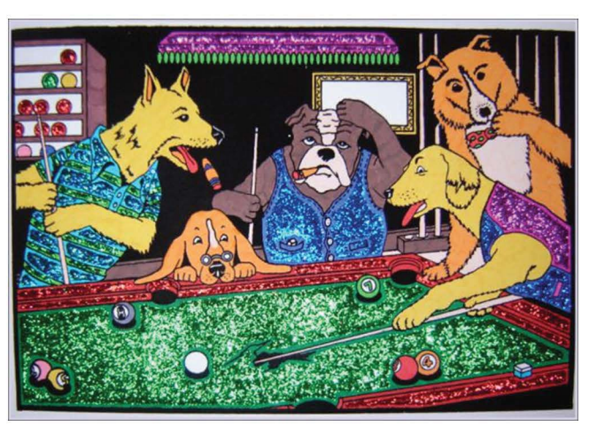
Have fun creating your own!