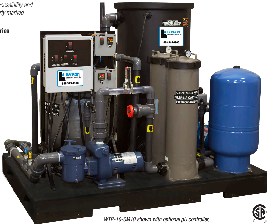
WTR-10-0M10 shown with optional pH controller, WX-0130 and ORP controller, WX-0131