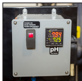
Optional pH controller, WX-0130

All options can be added to the WTR Series after the initial set-up.