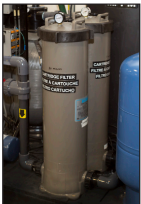
5 and 30-micron filters