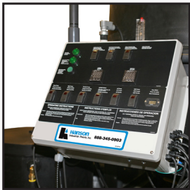
CSA listed NEMA-4 rated corrosion-proof control panel for safe and reliable operation