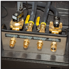
Hose connectors are clearly marked and designed for easy accessibility and quick installation

Recommended Air Compressor AM1-HE02-05M for use with the auto-backwash models