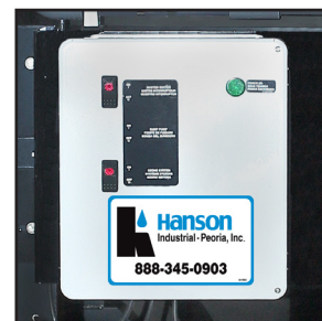
CSA listed NEMA-4 rated corrosion-proof control panel for safe and reliable operation (WCL-30D-0M10 only)