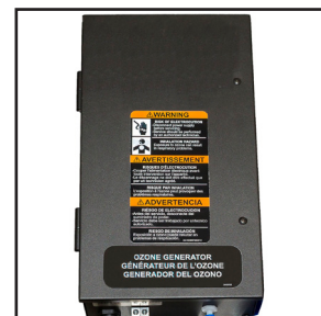
Ozone generator for a "quick kill" of live bacteria on contact (WCL-30D-0M10 only)