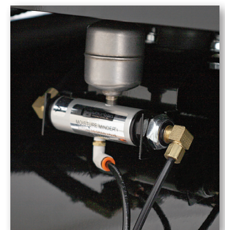
Tank drain automatically drains liquid from the air receiver