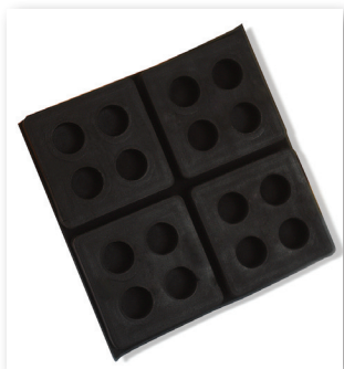
Vibration isolator pads protect the tank from stress