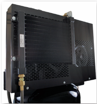
Air-cooled after cooler removes up to 65% of moisture and drops temperature within 10°F of ambient