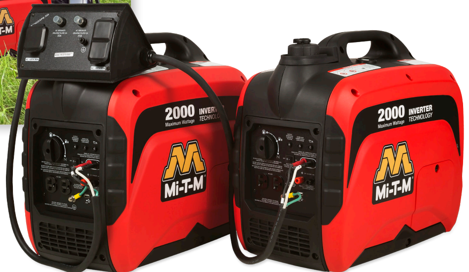
(2) GEN-2000-IMMO shown with parallel port box accessory, AW-5100-0001