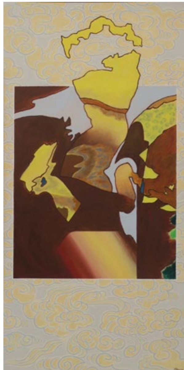
Pipe Dream (Scroll No. 2) Acrylic on canvas 48 x 24 in. / 122 x 61 cm 2021