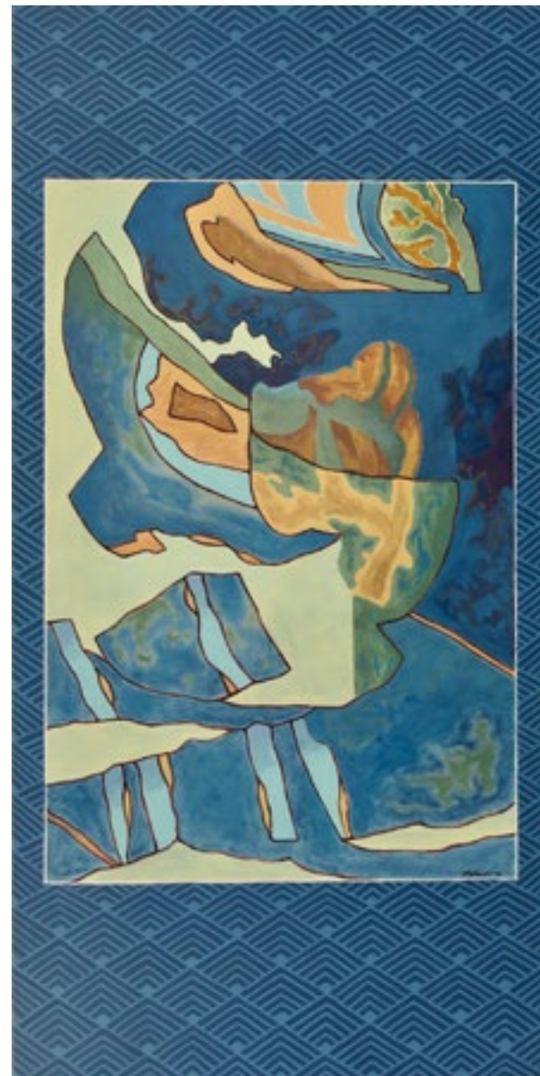
High Rise Denim (Scroll No. 6)

Acrylic on canvas 48 x 24 in. / 122 x 61 cm 2021