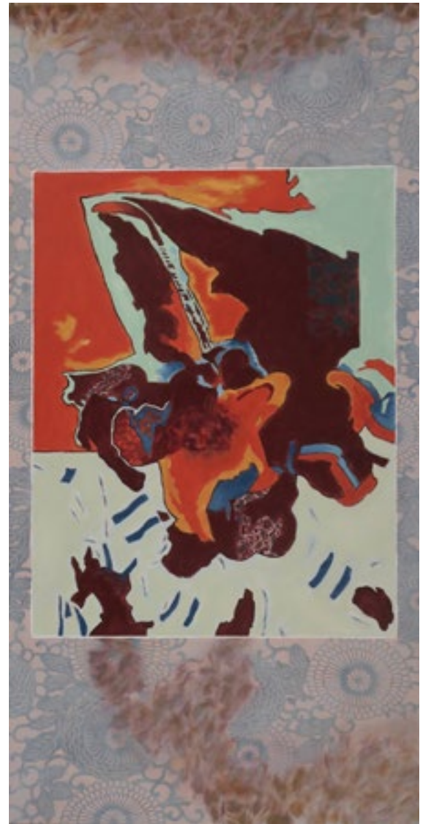
Red Ribbon (Scroll No. 9)