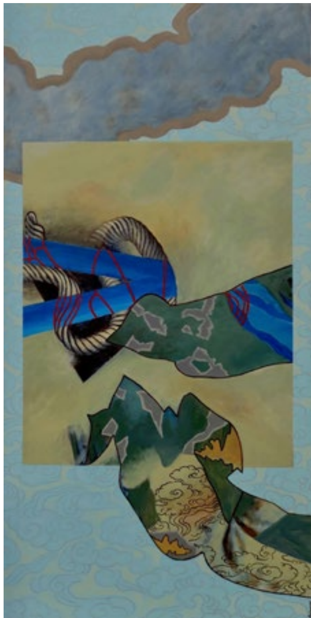
Twiser (Scroll No. 1) Acrylic on canvas 48 x 24 in. / 122 x 61 cm 2021