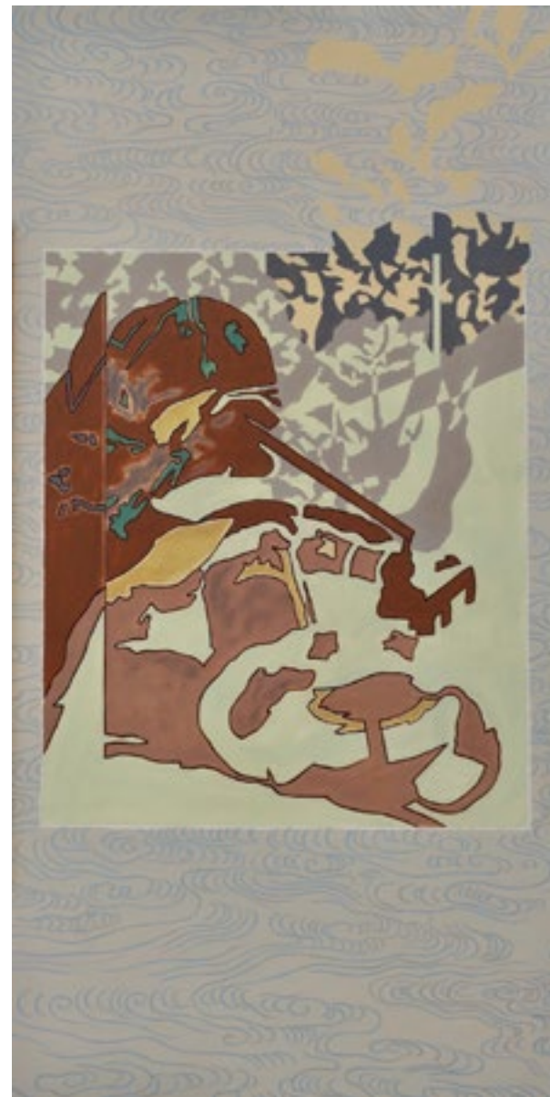
Side Line (Scroll No. 4)

Acrylic on canvas 48 x 24 in. / 122 x 61 cm 2021