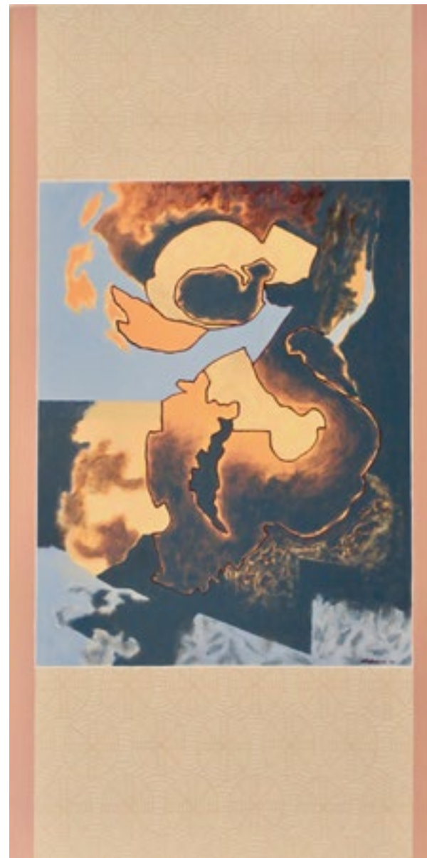
Rising Embers 2 (Scroll No. 11)

Acrylic on canvas 48 x 24 in. / 122 x 61 cm 2021