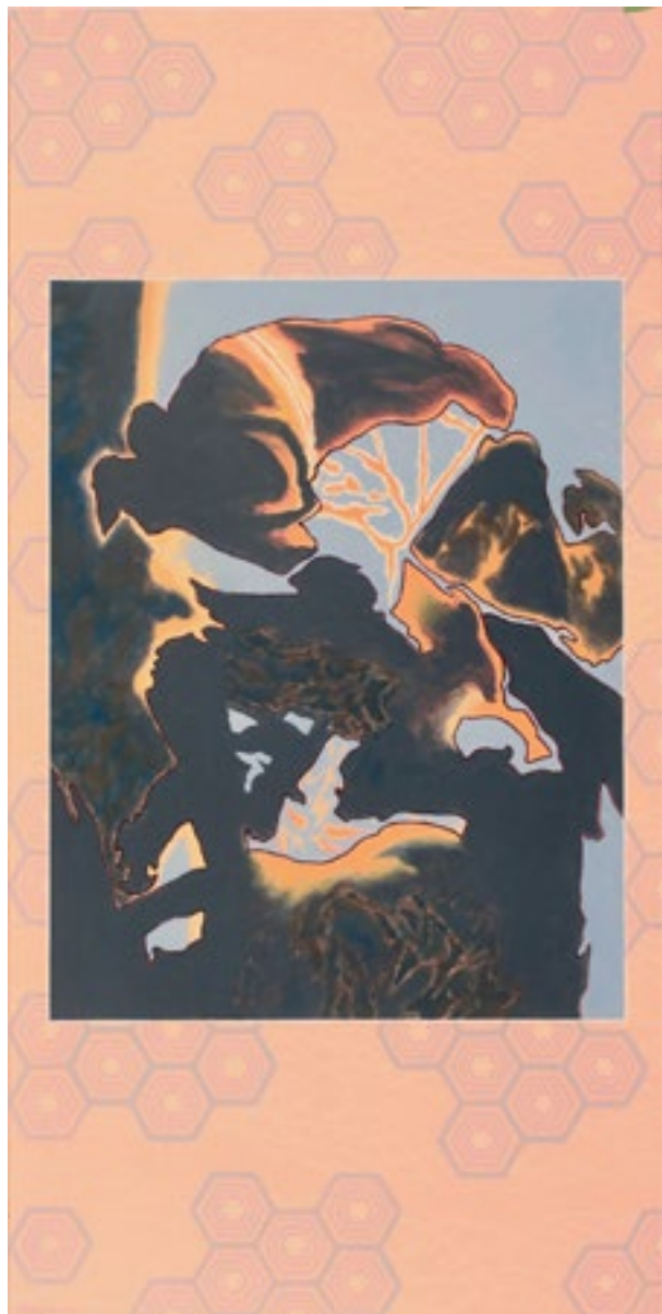
Rising Embers 1 (Scroll No. 10)

Acrylic on canvas 48 x 24 in. / 122 x 61 cm 2021