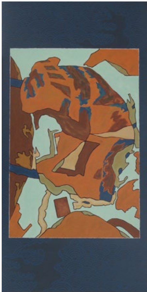
Recreation Centre (Scroll No. 5)

Acrylic on canvas 48 x 24 in. / 122 x 61 cm 2021