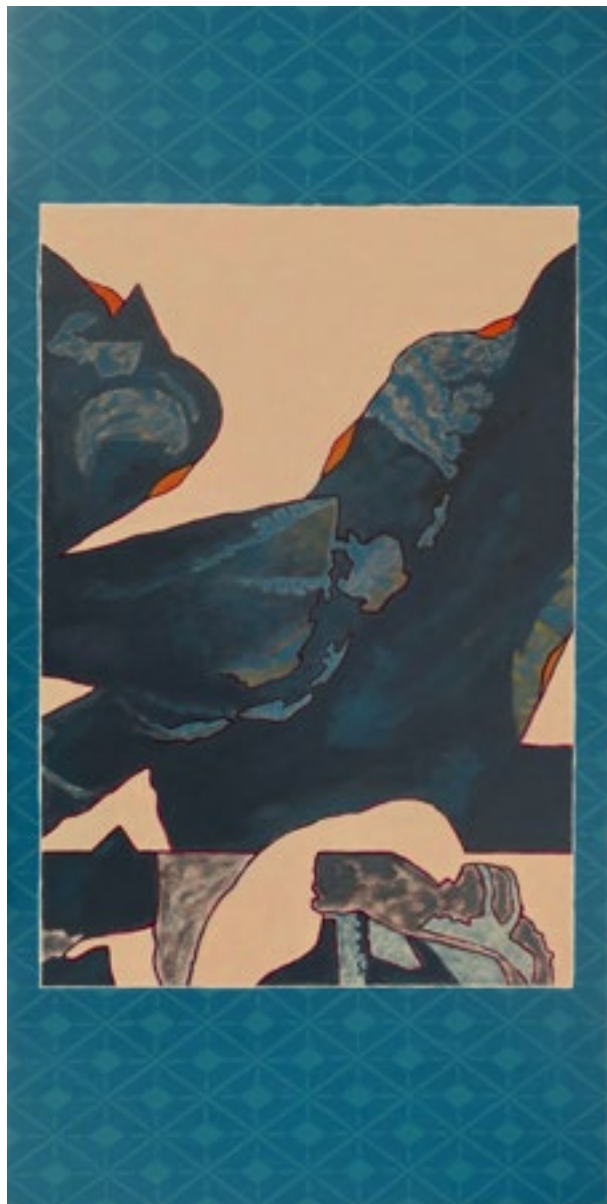
Night School (Scroll No. 7)

Acrylic on canvas 48 x 24 in. / 122 x 61 cm 2021