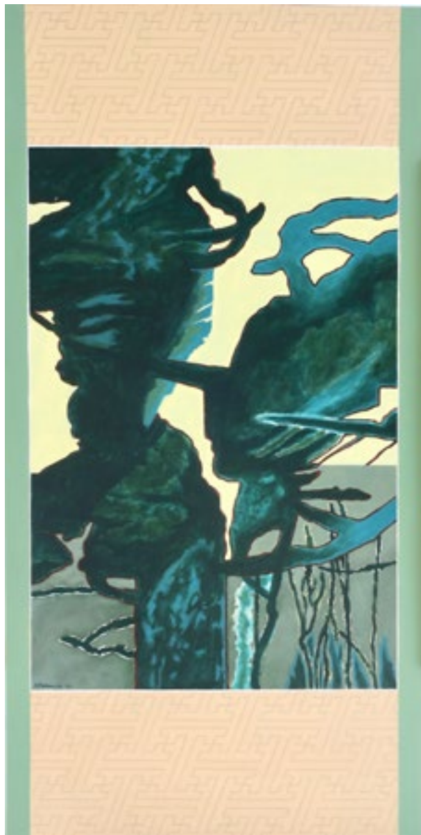
Hedge Row 1 (Scroll No. 12)

Acrylic on canvas 48 x 24 in. / 122 x 61 cm 2021