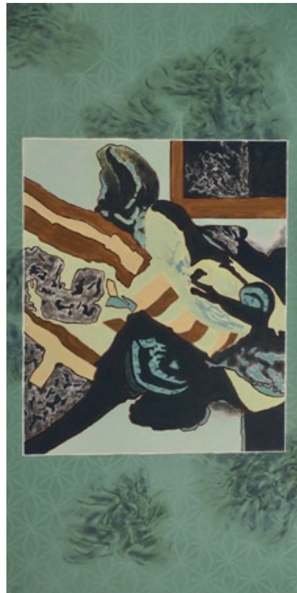
Shade Garden (Scroll No. 8)

Acrylic on canvas 48 x 24 in. / 122 x 61 cm 2021