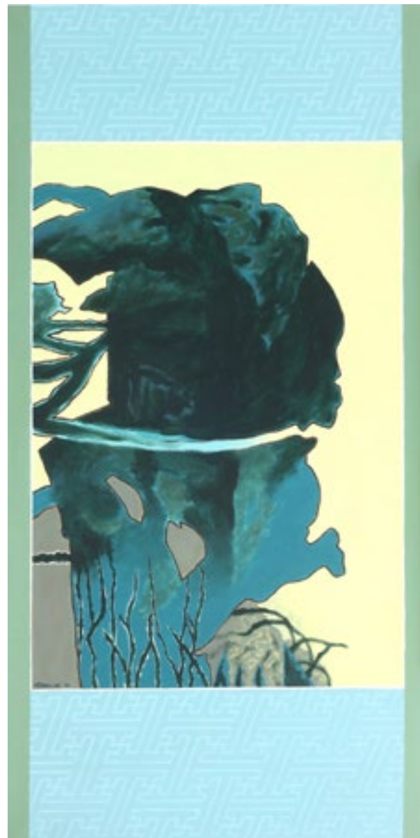
Hedge Row 2 (Scroll No. 13)

Acrylic on canvas 48 x 24 in. / 122 x 61 cm 2021