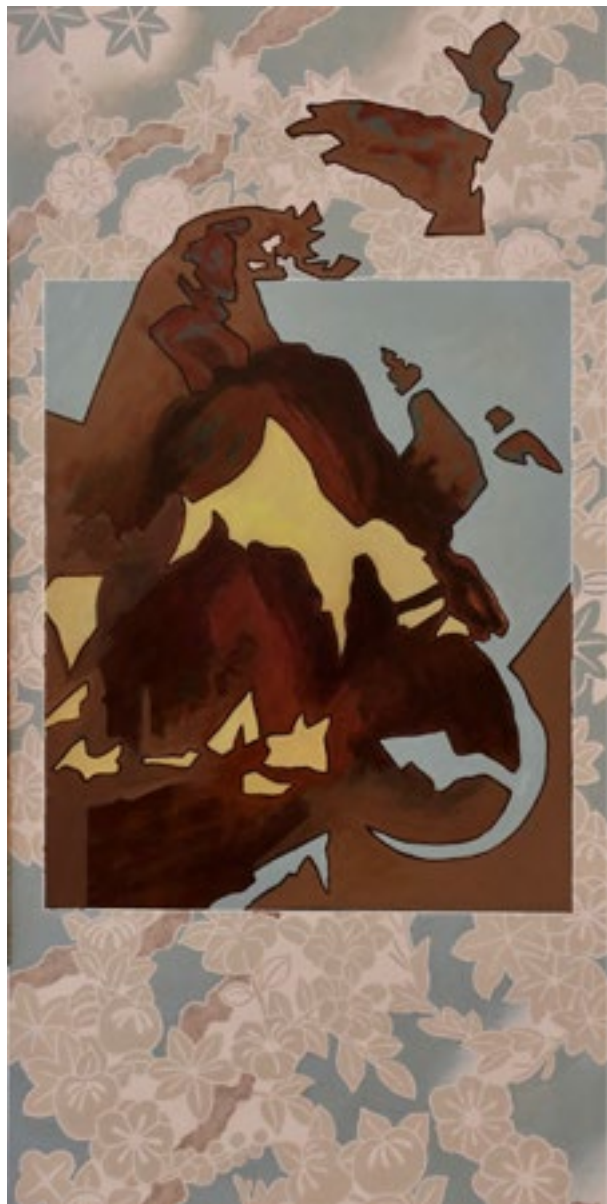
Uneven Ground (Scroll No. 3)

Acrylic on canvas 48 x 24 in. / 122 x 61 cm 2021