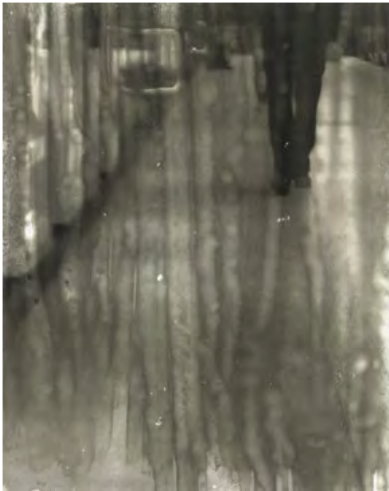
Passage 7 Laurier metro station Acrylic photo image transfer on matte polyester film 18 x 20in. / 45.72 x 50.8 cm Edition of 1 2020