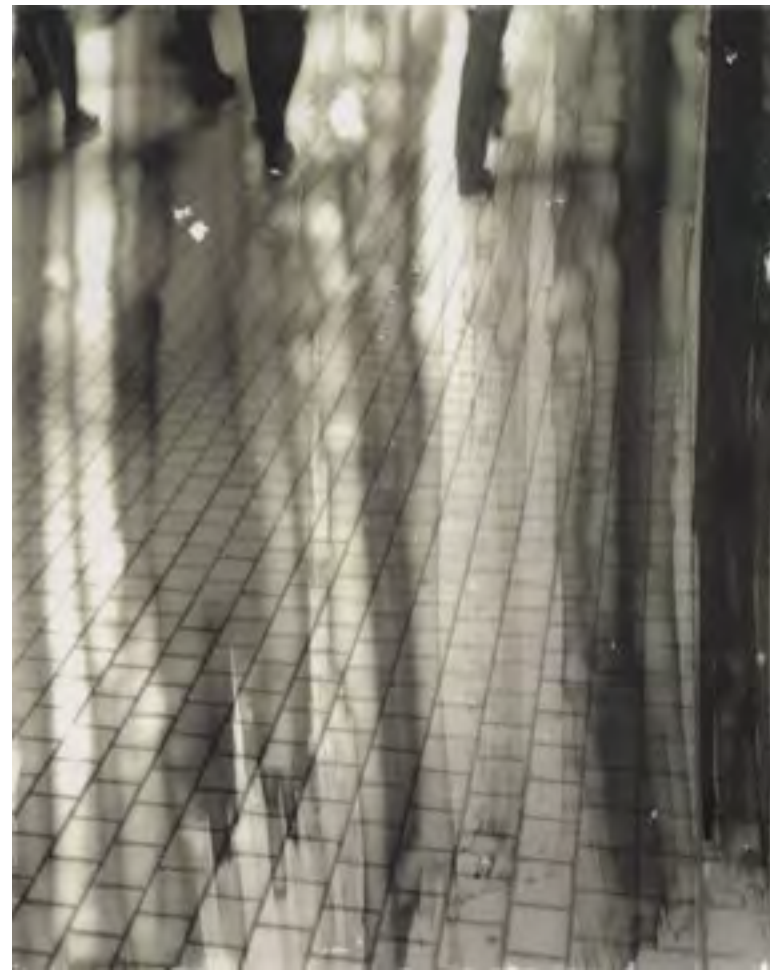
Passage 10 Jean Talon metro station Acrylic photo image transfer on matte polyester film 18 x 20in. / 45.72 x 50.8 cm Edition of 1 2020