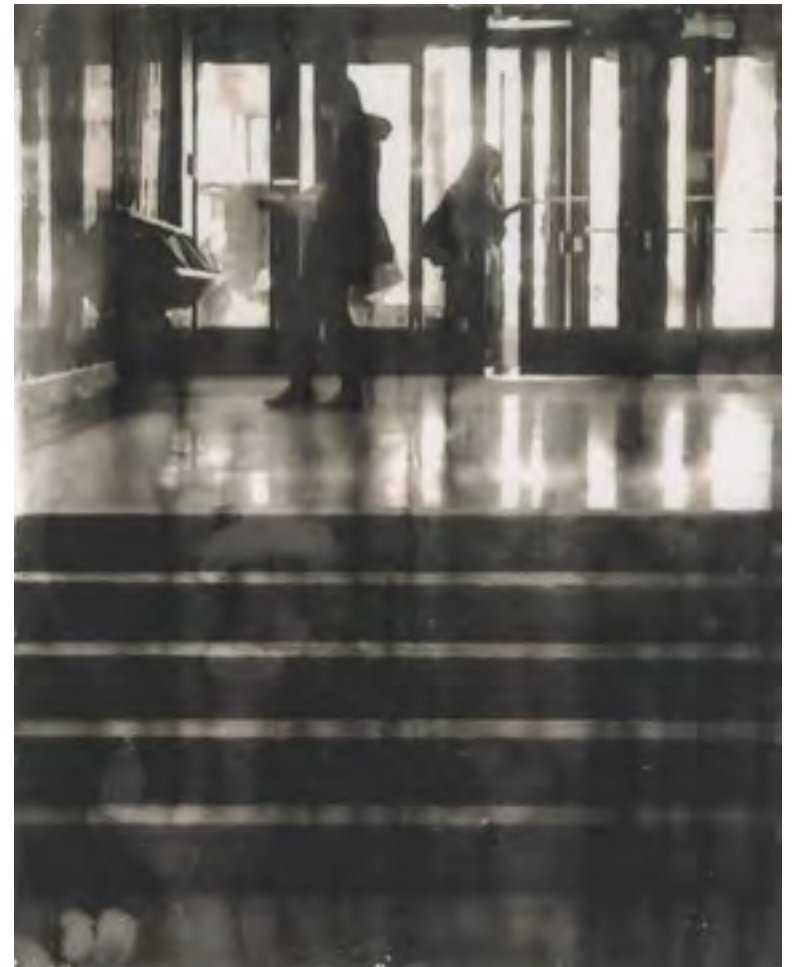
Passage 2 Place-des-Arts metro station Acrylic photo image transfer on matte polyester film 18 x 20in. / 45.72 x 50.8 cm Edition of 1 2020