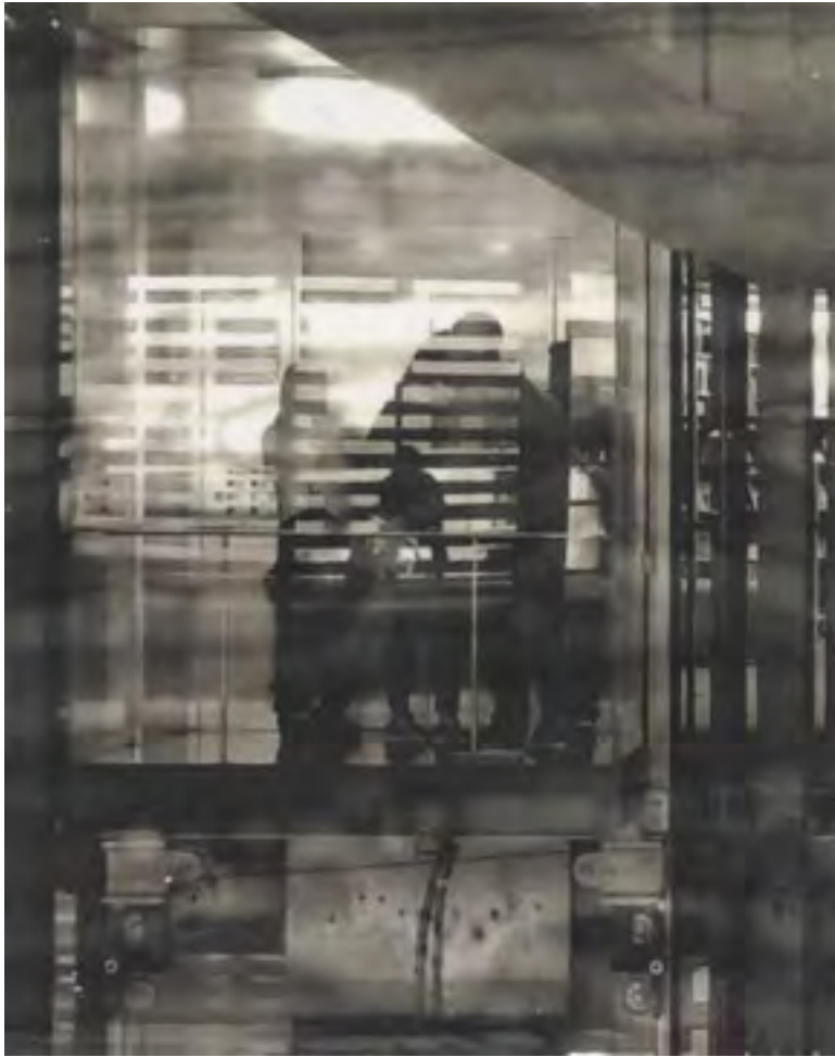
Passage 5 Grande Bibliothèque Acrylic photo image transfer on matte polyester film 18 x 20in. / 45.72 x 50.8 cm Edition of 1 2020