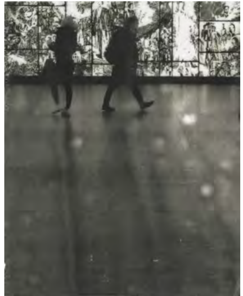
Passage 21 Place-des-Arts metro station Acrylic photo image transfer on matte polyester film 18 x 20in. / 45.72 x 50.8 cm Edition of 1 2020