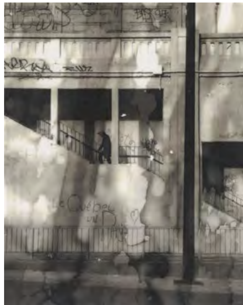
Passage 3 Grande Bibliothèque Inkjet print on archival Epson hot press paper 42.5 x 52 in. / 108 x 132 cm Edition of 3, framed 2020