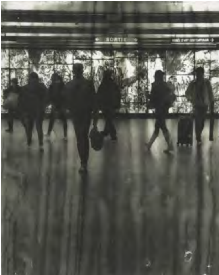
Passage 20 Place-des-Arts metro station Acrylic photo image transfer on matte polyester film 18 x 20in. / 45.72 x 50.8 cm Edition of 1 2020