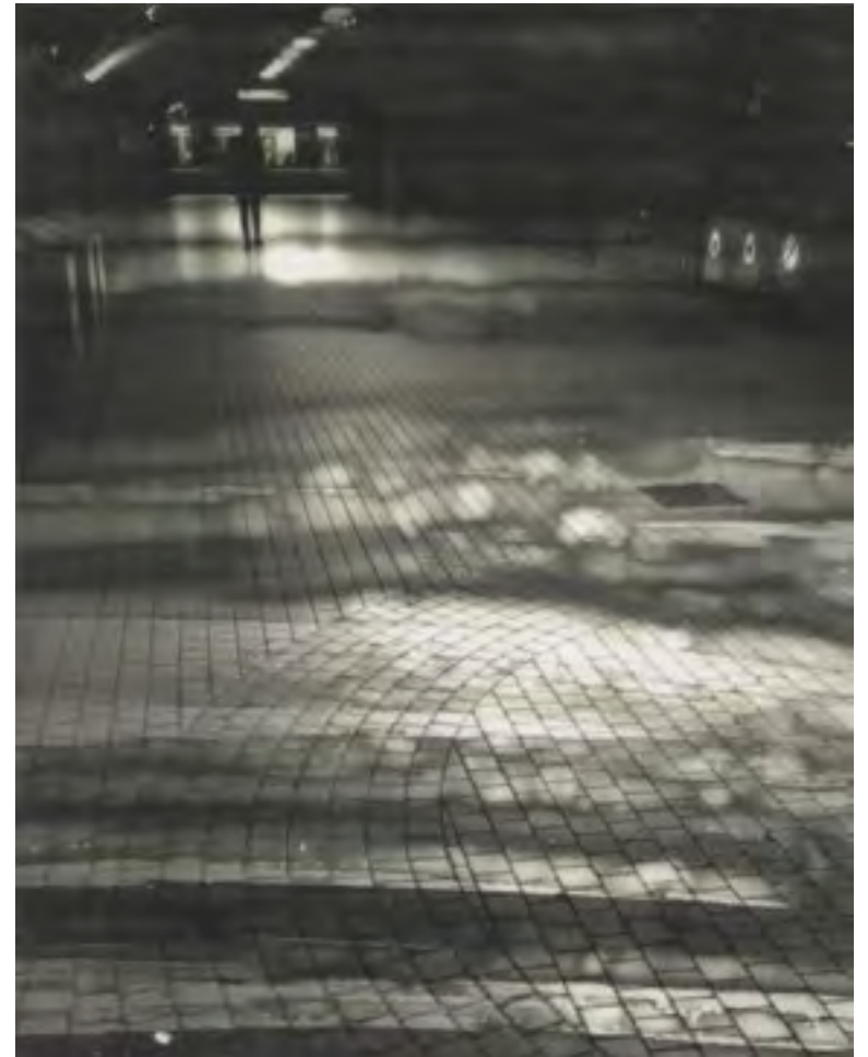
Passage 6 Jean Talon metro station Acrylic photo image transfer on matte polyester film 18 x 20in. / 45.72 x 50.8 cm Edition of 1 2020