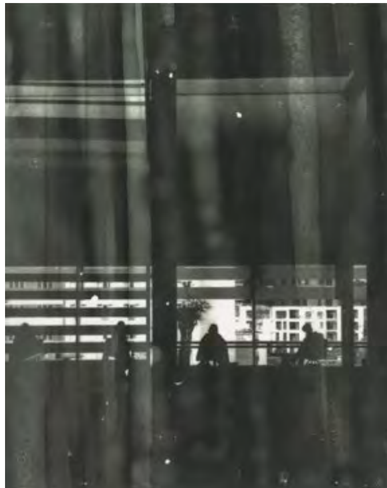
Passage 11 Grande Bibliothèque Acrylic photo image transfer on matte polyester film 18 x 20in. / 45.72 x 50.8 cm Edition of 1 2020