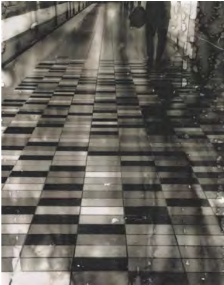
Passage 1 Guy-Concordia metro station Acrylic photo image transfer on matte polyester film 18 x 20in. / 45.72 x 50.8 cm Edition of 1 2020