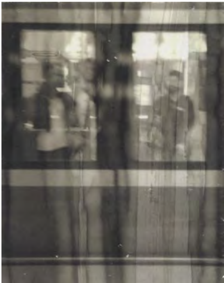
Passage 9 Berri-UQAM metro station Acrylic photo image transfer on matte polyester film 18 x 20in. / 45.72 x 50.8 cm Edition of 1 2020