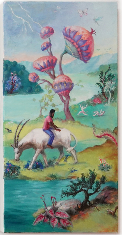
Ripple in Reality Oil on canvas Triptych: 24 x 12 / 24 x 30 / 24 x 12 in. Unframed 2023