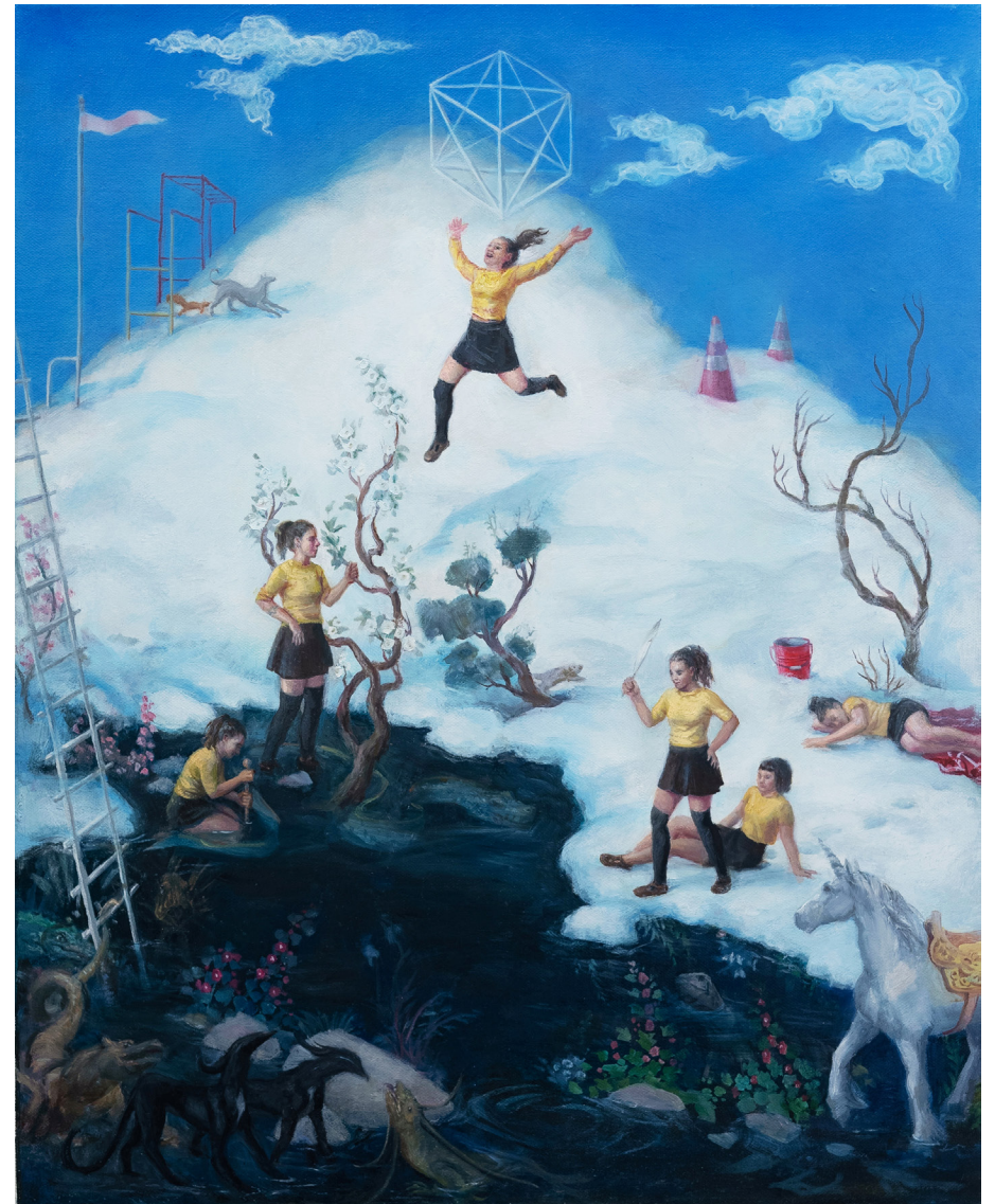
Uniforms and Ladders Oil on canvas 20 x 16 in. Unframed 2022