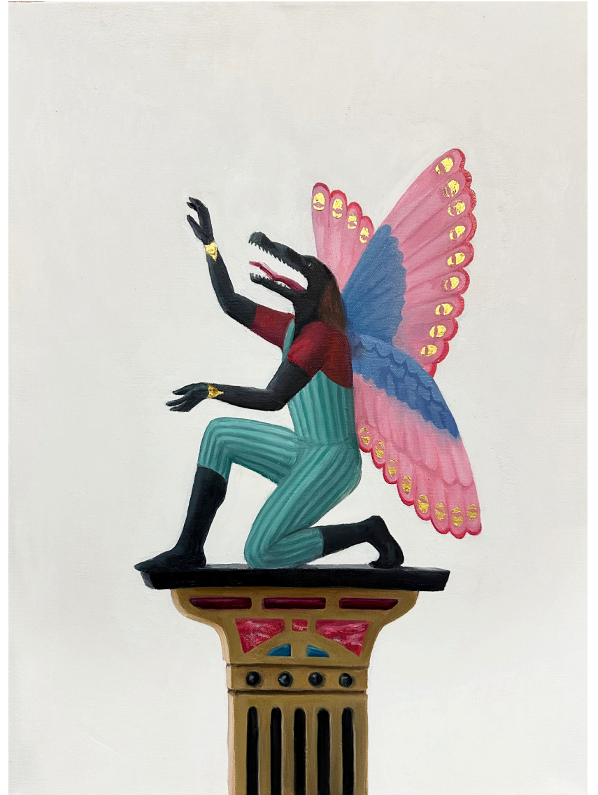
Guardians Oil and 24k gold leaf on canvas Diptych: 24 x 18 in. each Unframed 2024