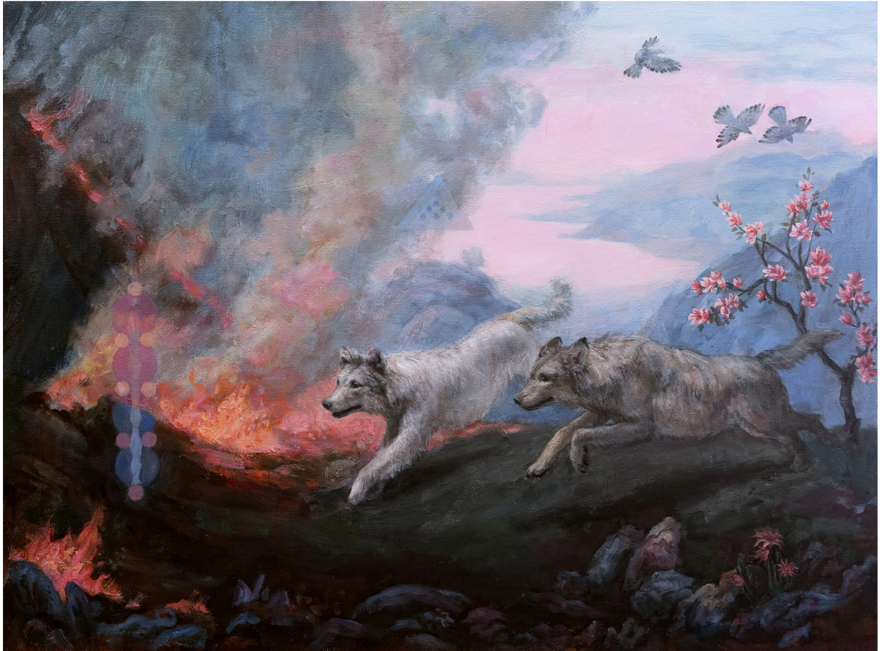
Alchemy/Transmutation, Oil on canvas, 18 x 24 in. Unframed, 2023, CAD 6,300