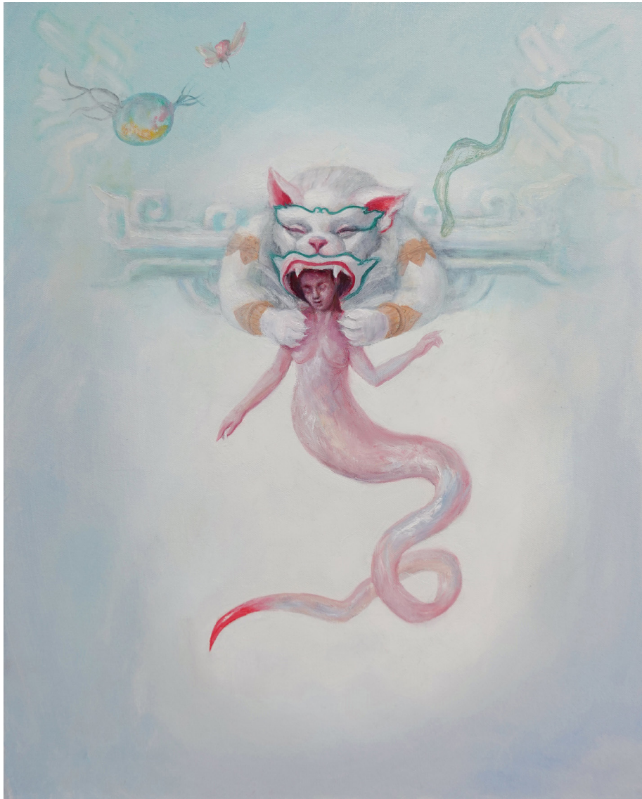
Transmutation Oil on canvas 20 x 16 in. Unframed 2023