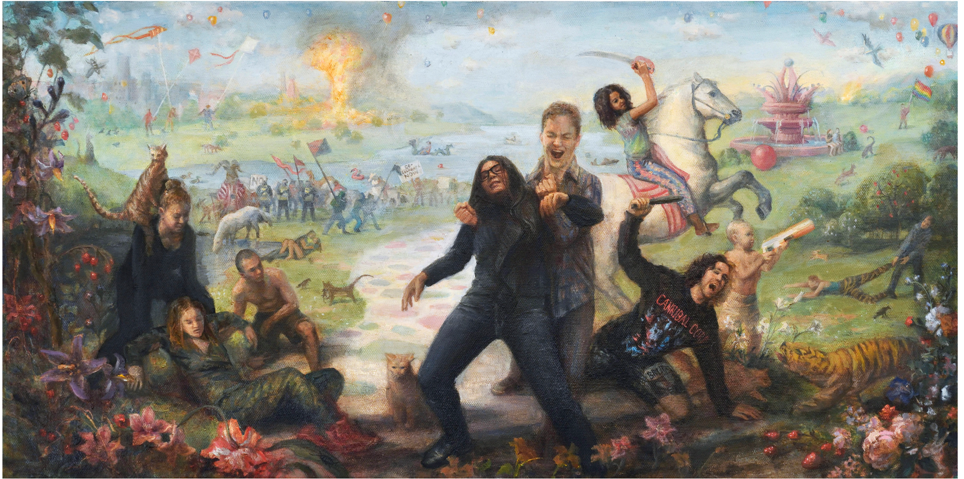
Candyland Oil on canvas 12 x 24 in. Unframed 2020