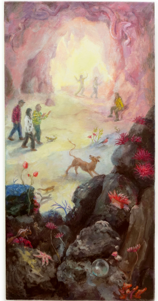
The Crossing Oil on canvas Triptych: 20 x 10 in. / 20 x 16 in. / 20 x 10 in., Unframed 2023