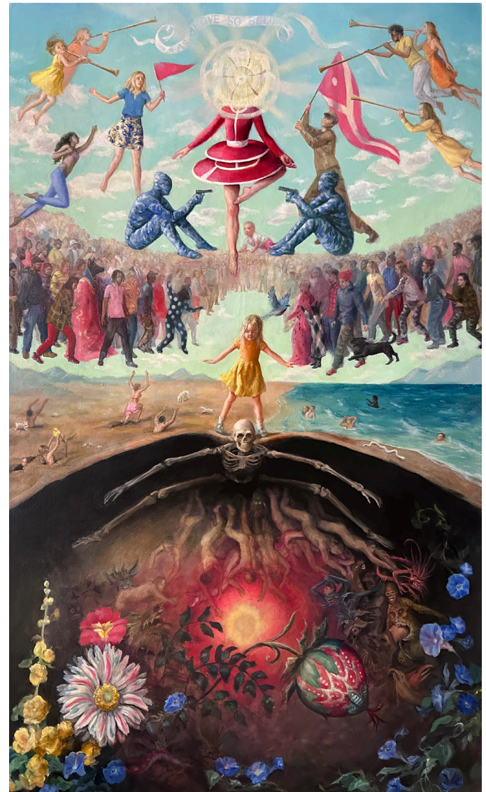
As Above So Below Oil on canvas 50 x 30 in. Unframed 2023