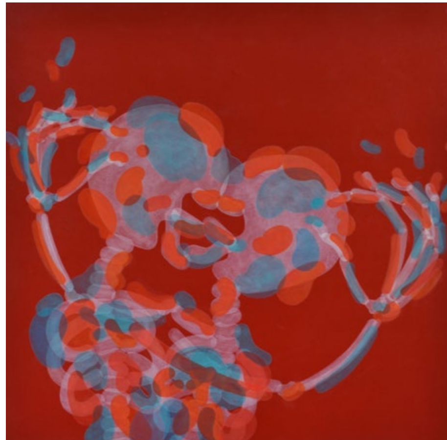
Refuge II Laurence Finet Oil on wood panel 30 x 30 in. / 76 x 76 cm Unframed 2022