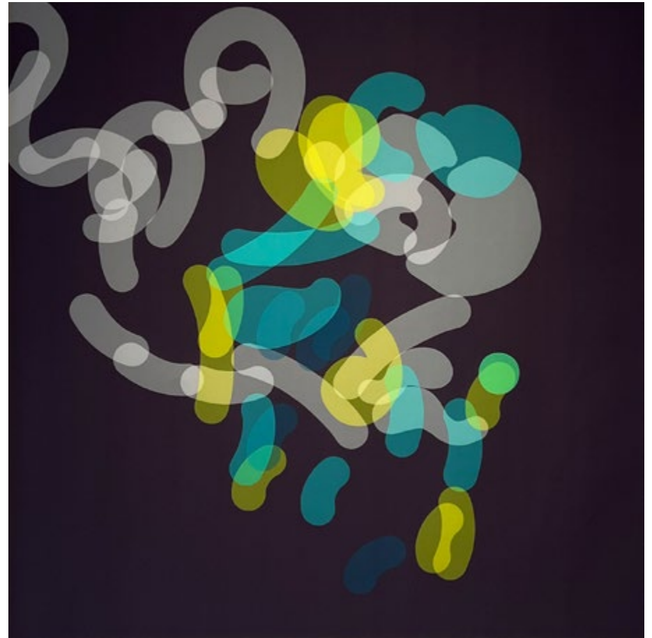
Grey Algorithm - Blue Variation (0222-028)