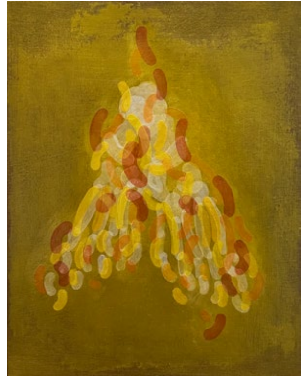
Sacré II Laurence Finet Oil on wood panel 14 x 11 in. / 36 x 28 cm Unframed 2022