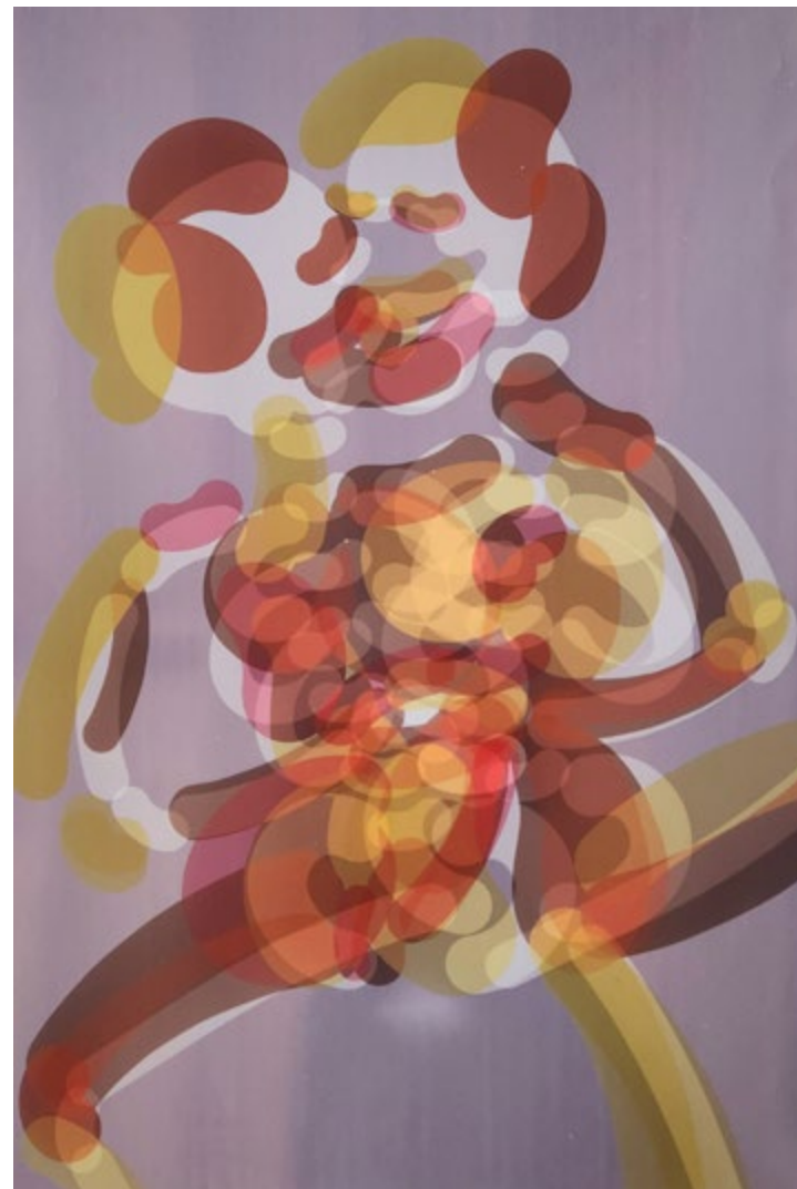
Indélébile Laurence Finet Plexiglass print over ricér paper print 30 x 20 in. / 76 x 51 cm Custom framed 2023