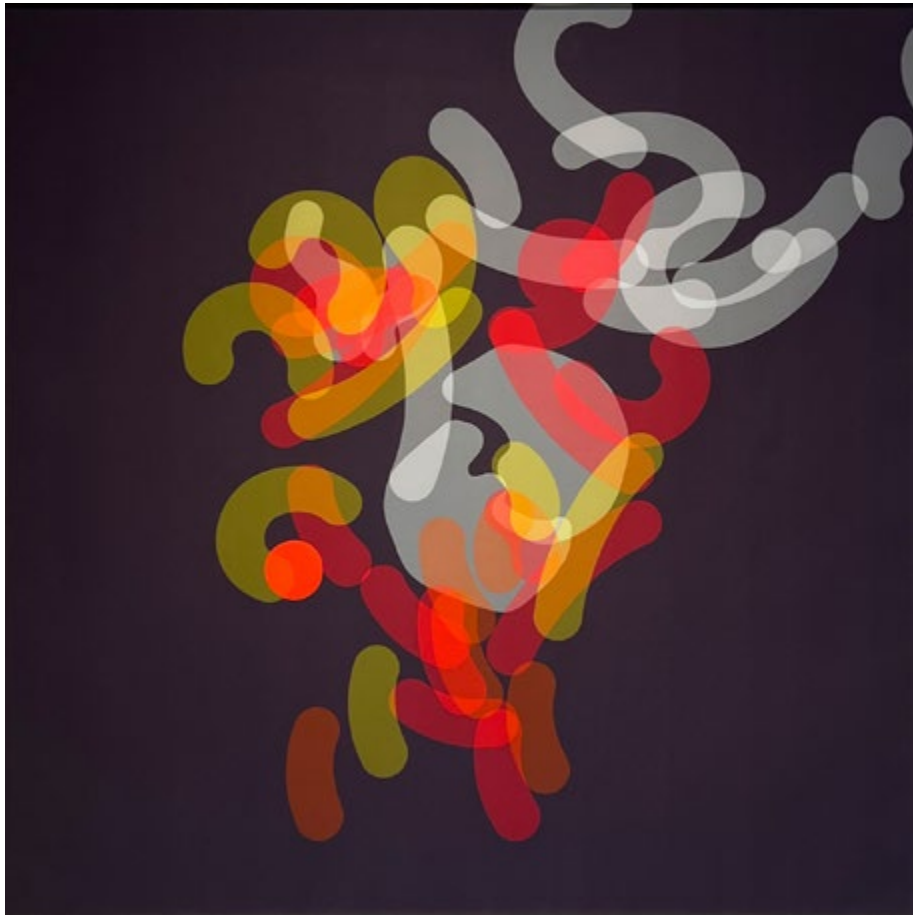
Grey Algorithm - Coral Variation (0222-034)