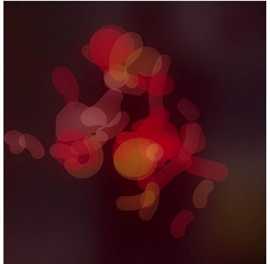
Red Algorithm (1117-029)