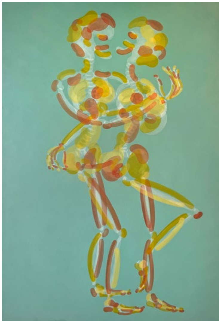
Deluge Laurence Finet Oil on wood panel 60 x 40 in. / 152 x 102 cm Unframed 2023