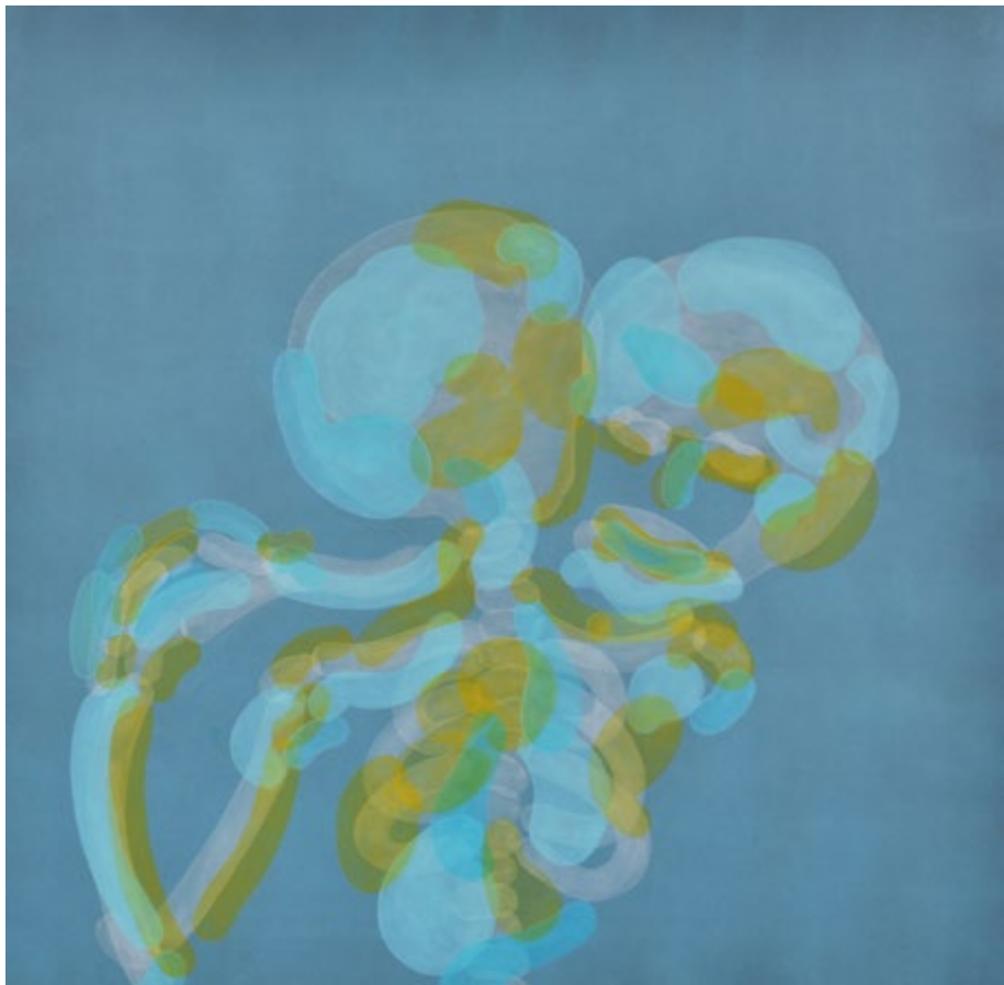
Valse Laurence Finet Oil on wood panel 30 x 30 in. / 76 x 76 cm Unframed 2022