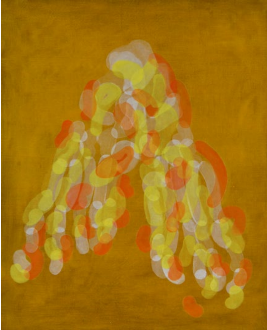
Sacré III Laurence Finet Oil on wood panel 20 x 16 in. / 51 x 41 cm Unframed 2022