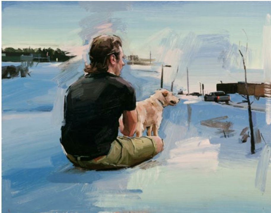
Prob, Maybe, Someday