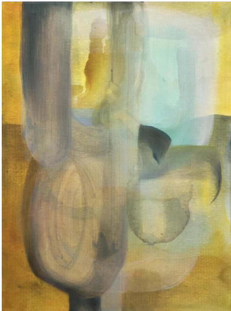
Delivery System II Alexandra Flood Acrylic on canvas 24 x 18 in. / 61 x 46 cm Custom framed 2023