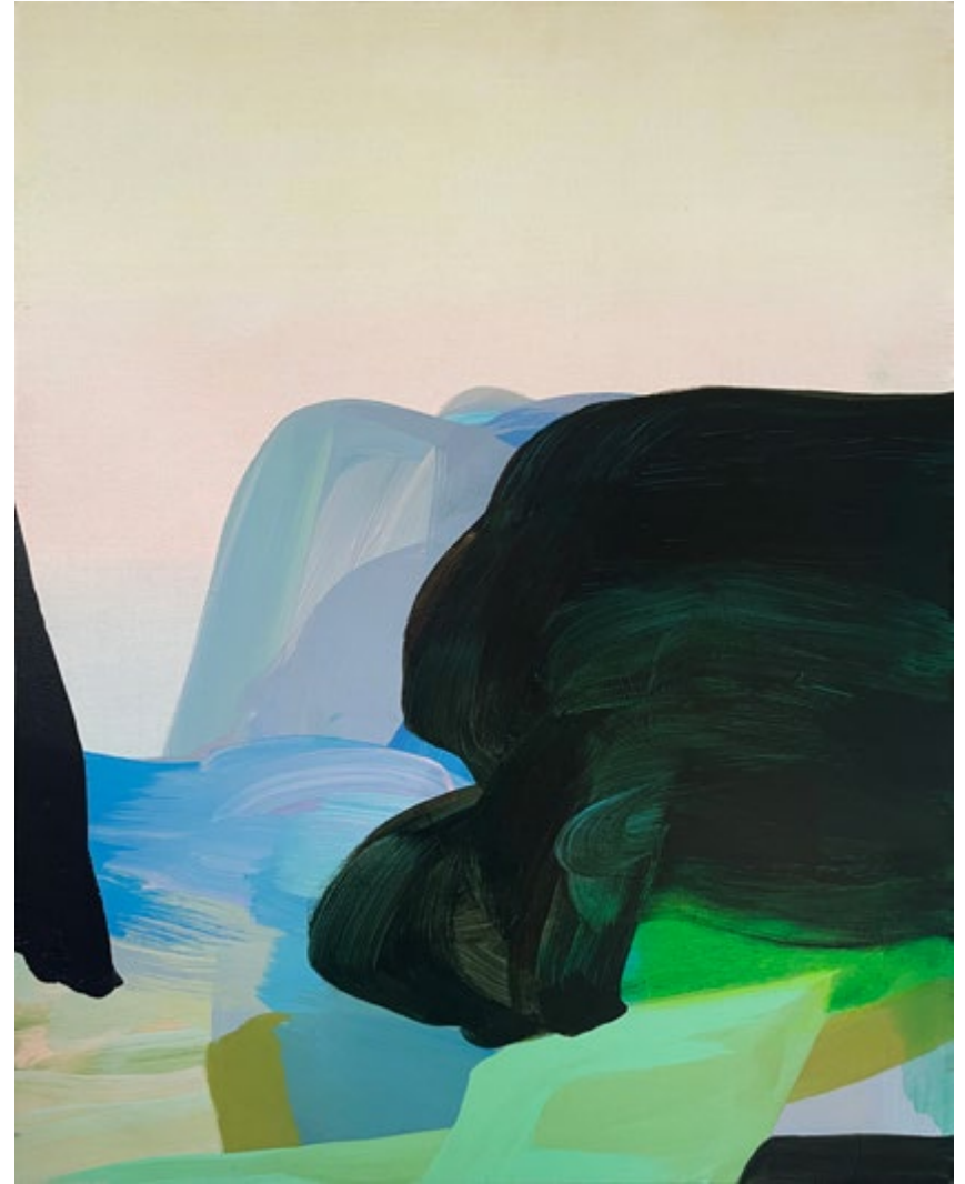
Pretty Girl Alexandra Flood Acrylic on canvas 30 x 24 in. / 76 x 61 cm Unframed 2022