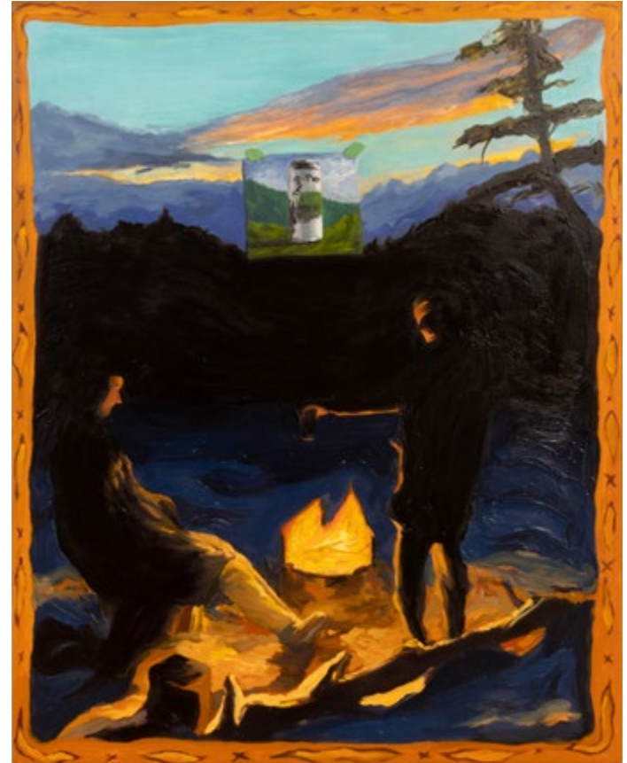
Fireside Atticus Gordon Oil on canvas 16 x 20 in. / 41 x 51 cm Unframed 2023