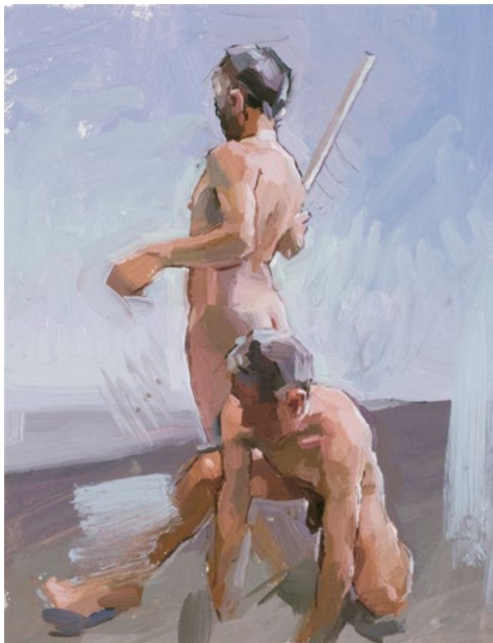
It'll Be True Until It Isn't Andrew Morrow Oil on paper 7 x 5.5 in. / 18 x 14 cm Unframed 2023