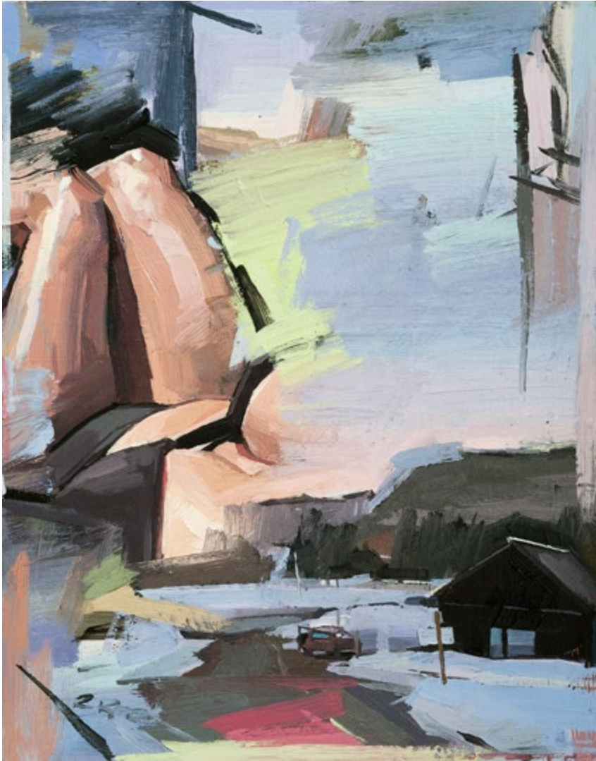
Make It Weird Andrew Morrow Oil on panel 14 x 11 in. / 36 x 28 cm Unframed 2023