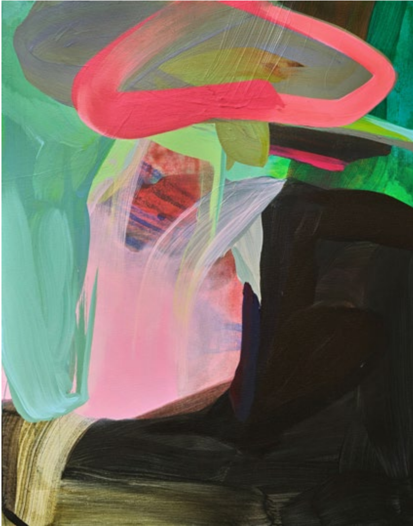
Delivery System III Alexandra Flood Acrylic on canvas 28 x 22 in. / 71 x 56 cm Unframed 2023