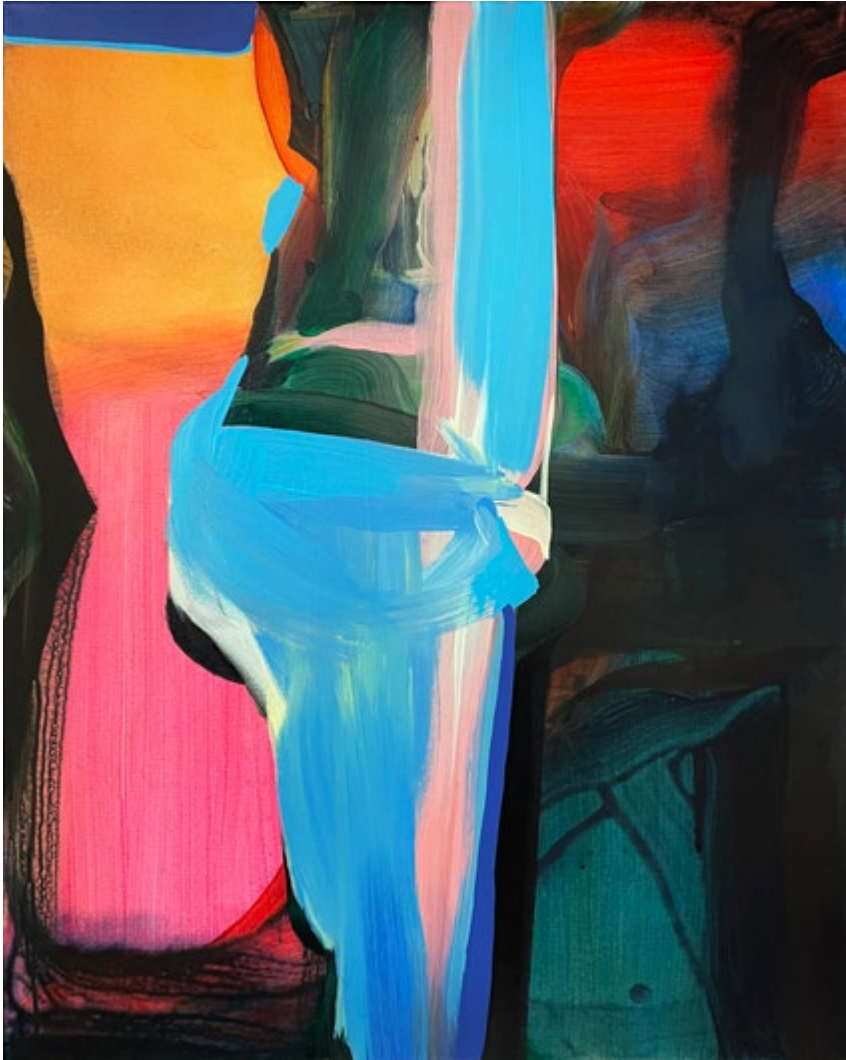
Delivery System IV Alexandra Flood Acrylic on canvas 30 x 24 in. / 76 x 61 cm Unframed 2022