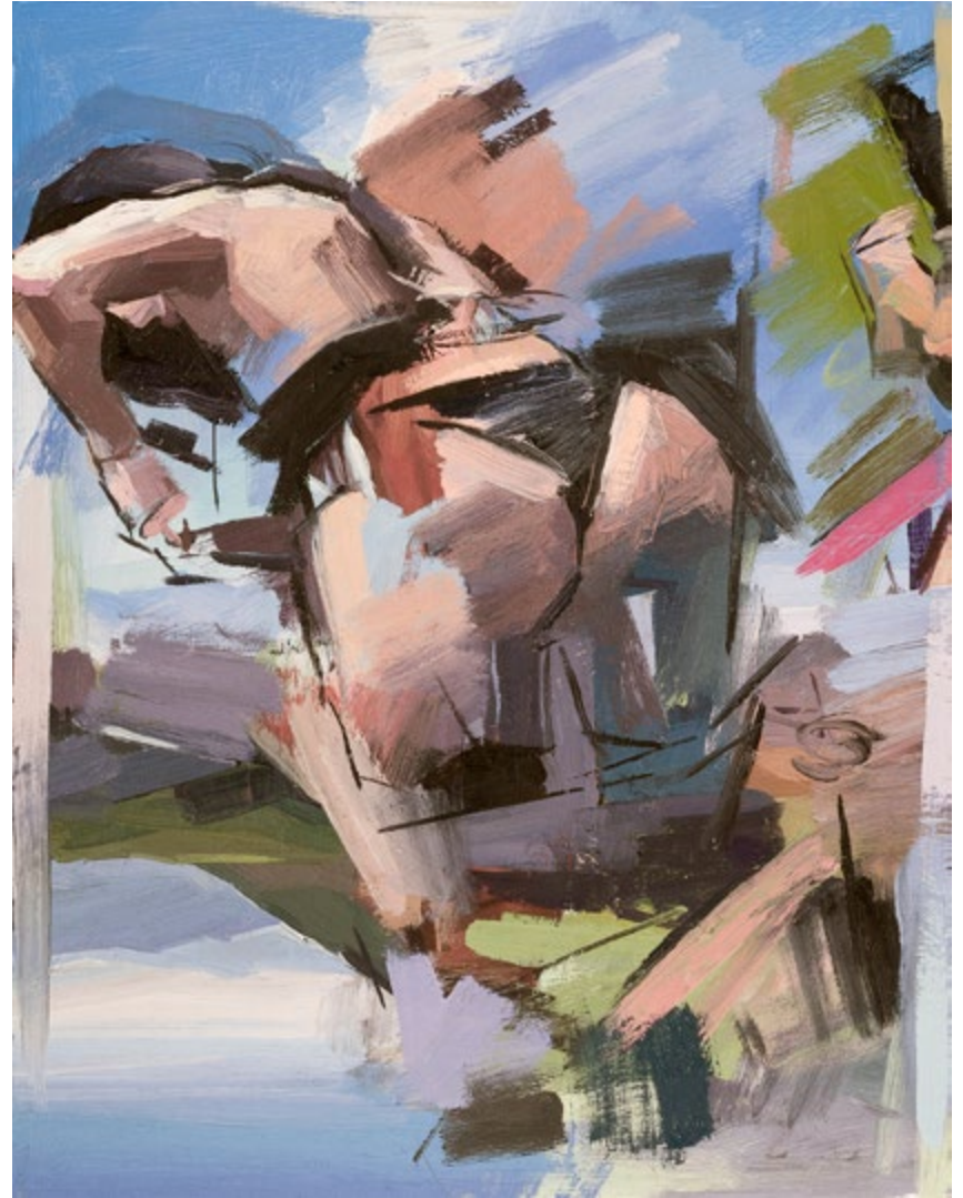
Don't Overthink It Andrew Morrow Oil on panel 14 x 11 in. / 36 x 28 cm Unframed 2023