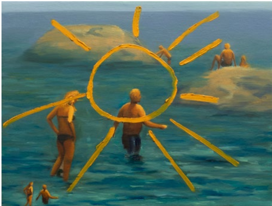
Little Smiley Atticus Gordon Oil on canvas 9 x 12 in. / 23 x 31 cm Unframed 2023