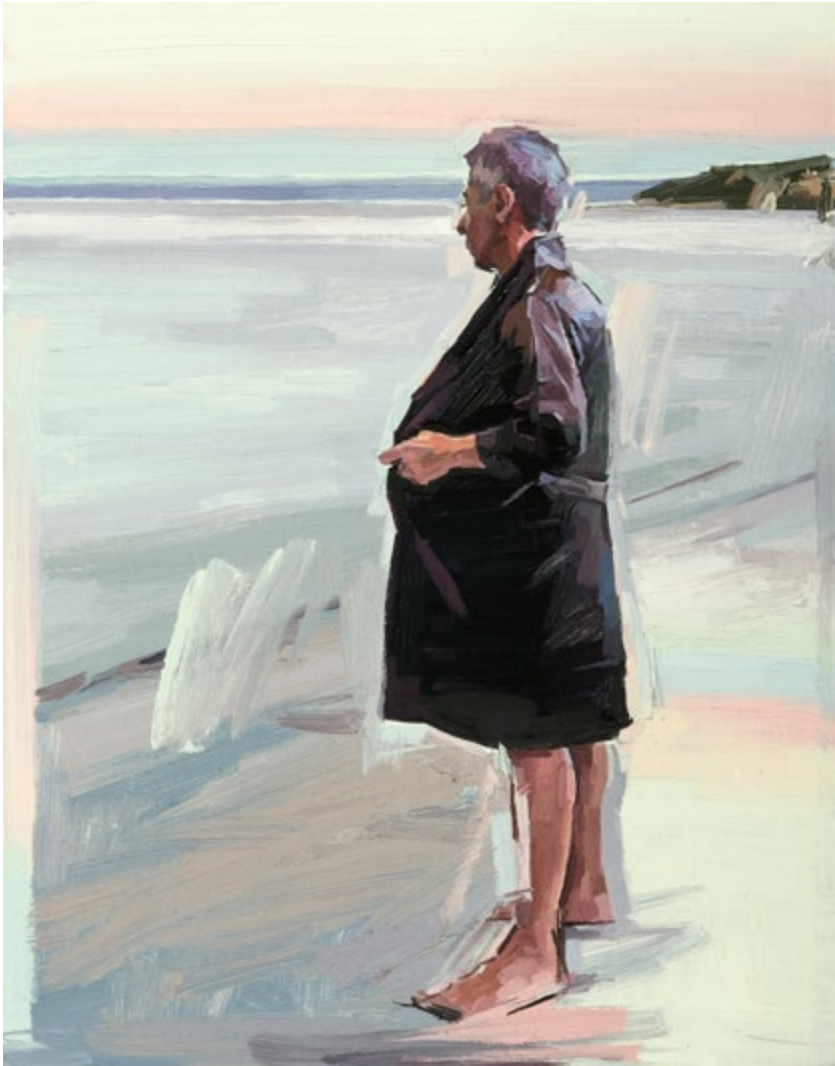
Se La Vi Andrew Morrow Oil on panel 14 x 11 in. / 36 x 28 cm Unframed 2023