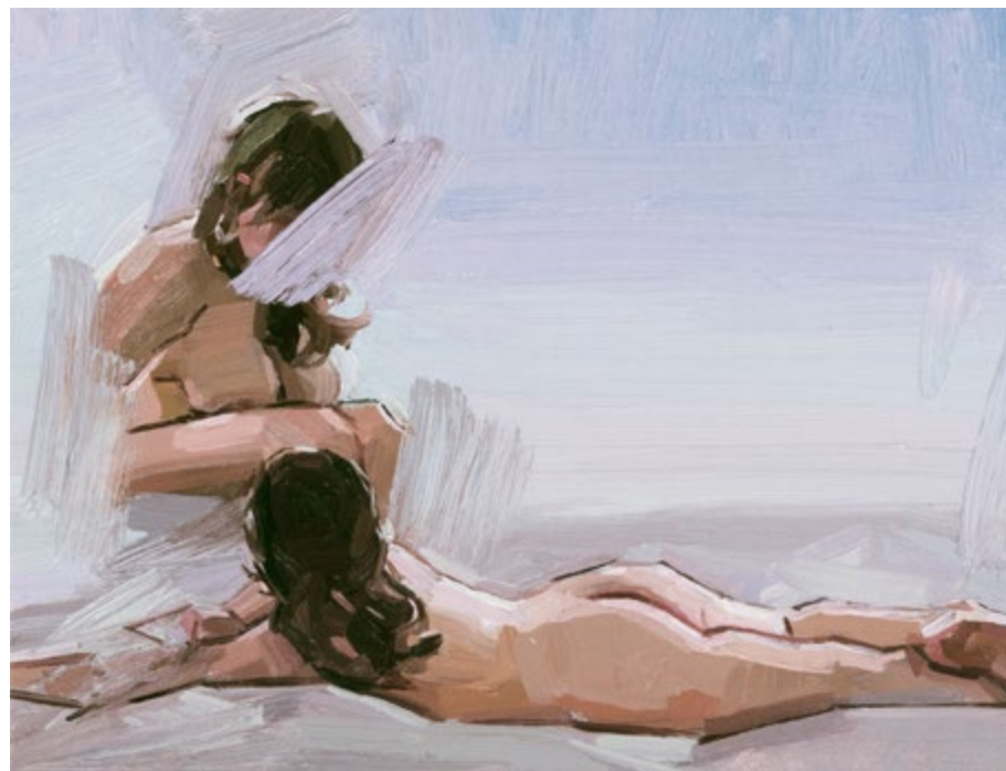
Exactly What I Had in Mind Andrew Morrow Oil on paper 7 x 5.5 in. / 18 x 14 cm Unframed 2023