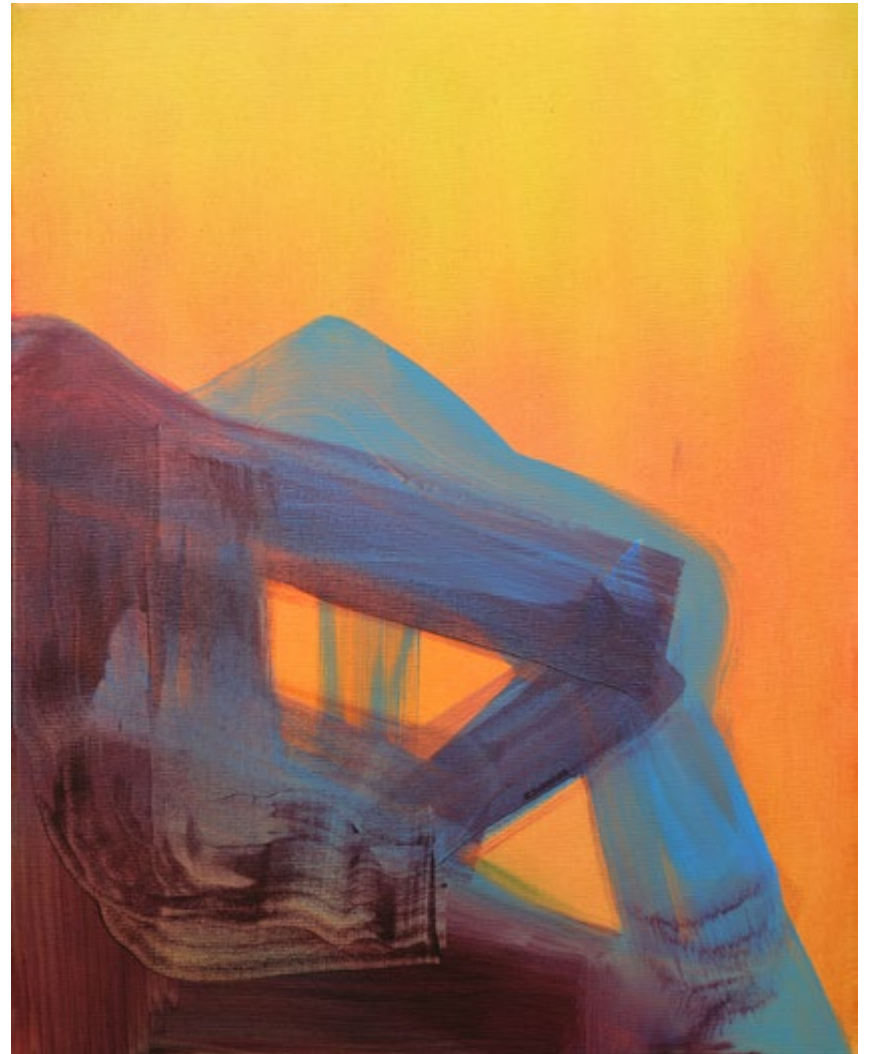
Alpha Decay VII Alexandra Flood Acrylic on canvas 30 x 24 in. / 76 x 61 cm Unframed 2023