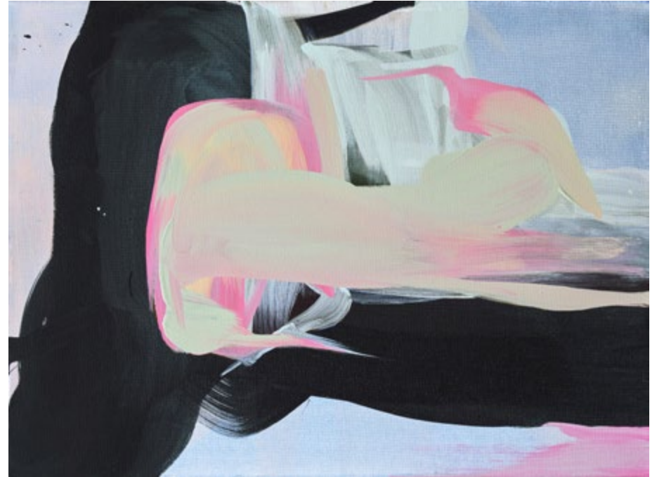
Richard's Equation Alexandra Flood Acrylic on canvas 18 x 24 in. / 46 x 61 cm Custom framed 2023