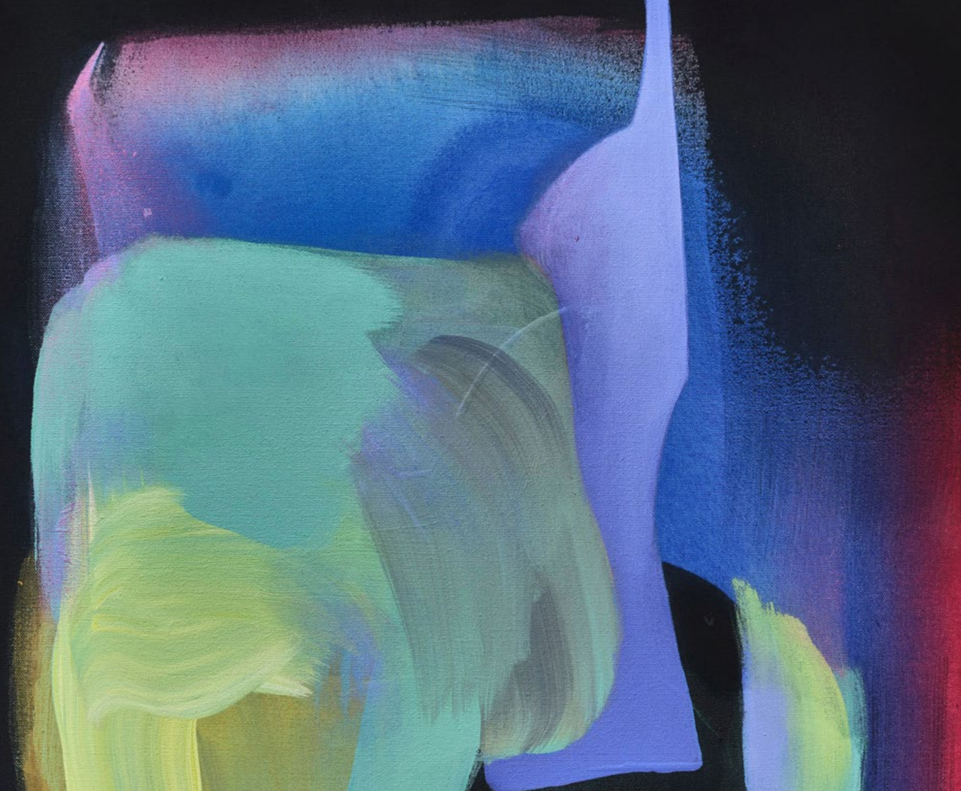
Detail: thesplit V , Alexandra Flood