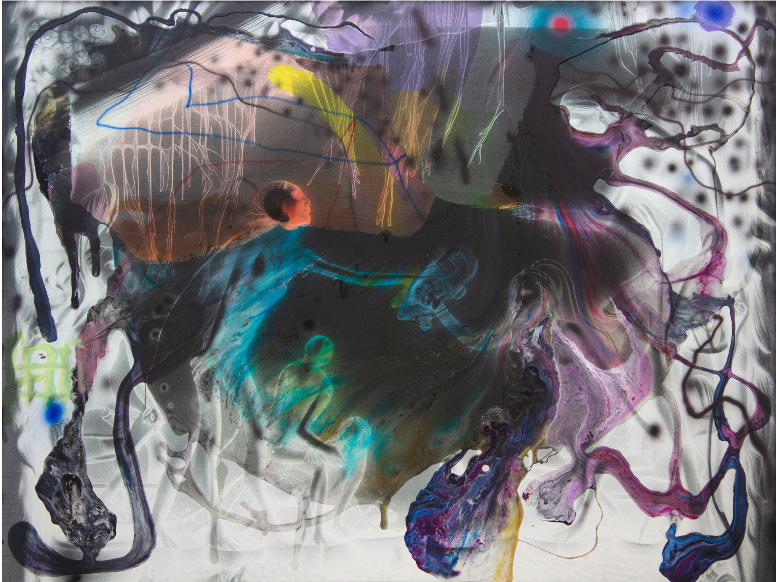
Alex Sutcliffe, Looking, Acrylic, ink, and diffusion-generated imagery UV printed on aluminum composite, 36x48 in. Unframed 2024 CAD 4,200