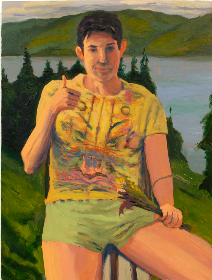
Atticus Gordon Everything is great, Everything is Fine Oil on panel 9x12 2023