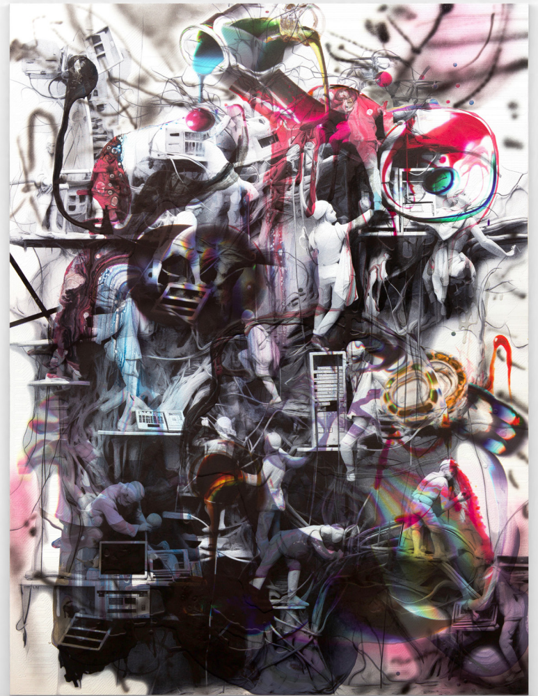
Alex Sutcliffe Path Finding Acrylic, ink, Diffusion-Generated Imagery, UV Printed on Aluminum Composite 48x36 in. Unframed 2024