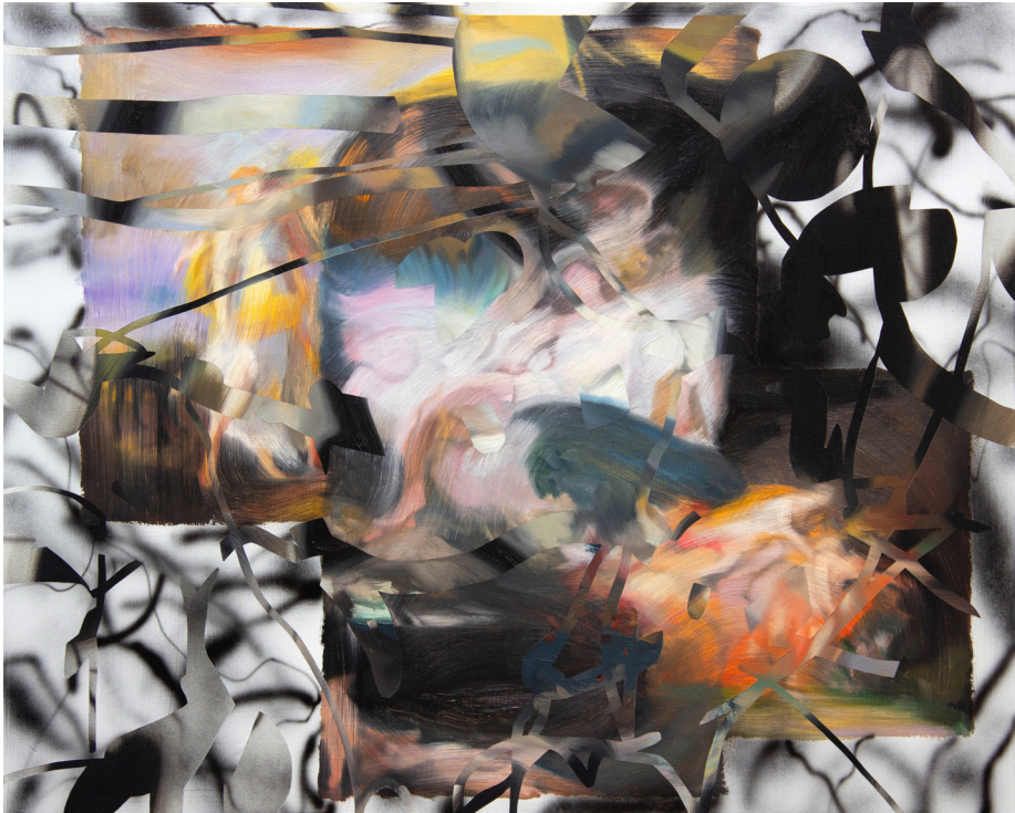
Alex Sutcliffe Windowed Acrylic and Oil on Canvas 24x30 in. Unframed 2024