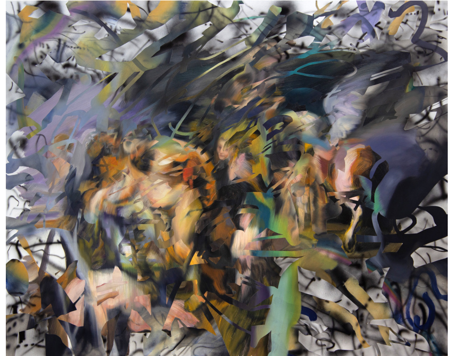
Alex Sutcliffe Out of the Forest Acrylic and Oil on Canvas 48x60 in. Unframed 2024