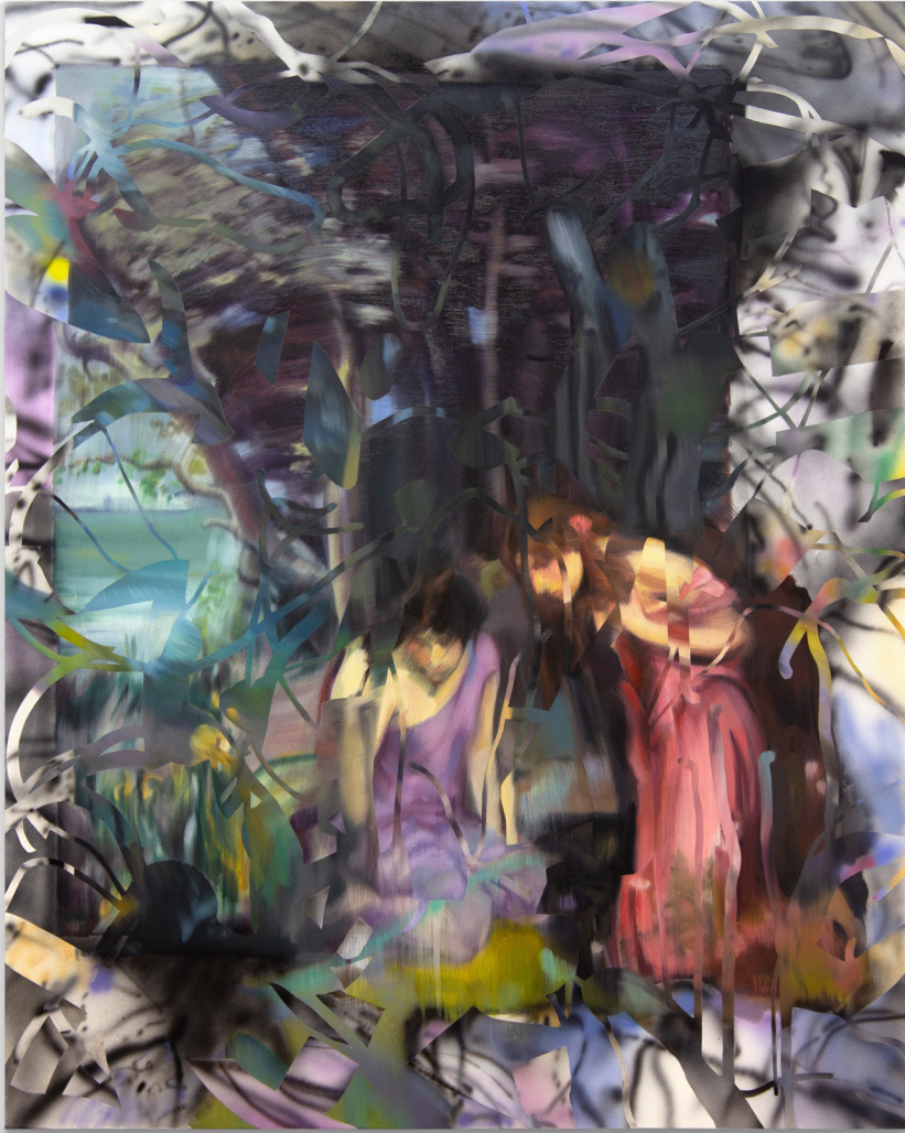
Alex Sutcliffe Dissolving Forest Acrylic and Oil on Canvas 60x48 in. Unframed 2024