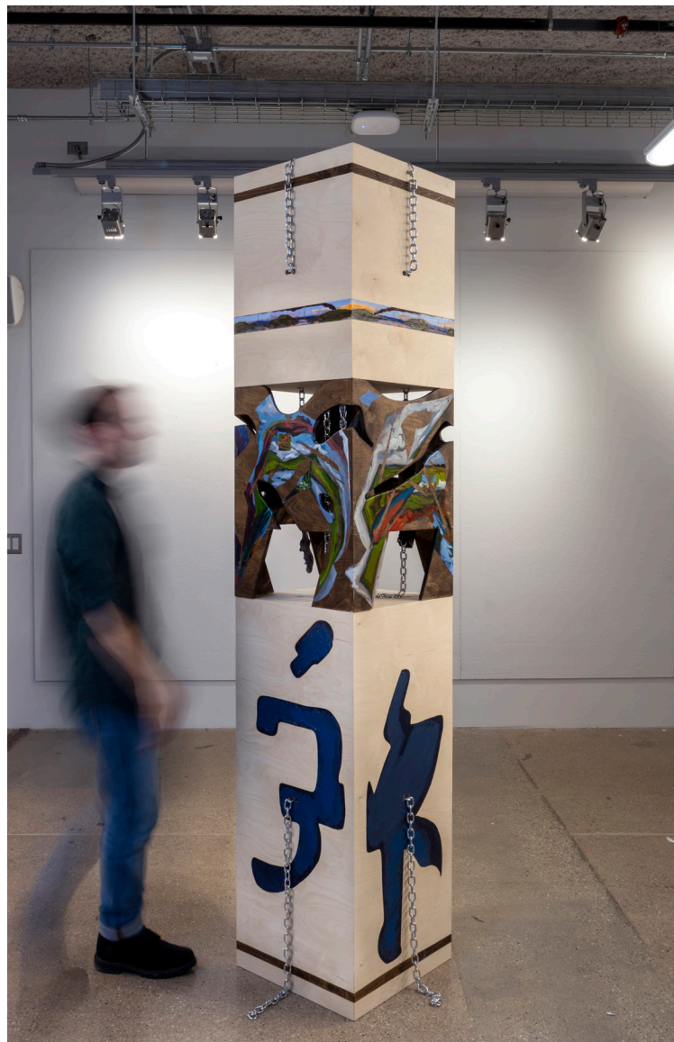
Atticus Gordon Ai Veneration Monument Oil on birch, with zinc chain and found objects. 97x18x18 in. 2022