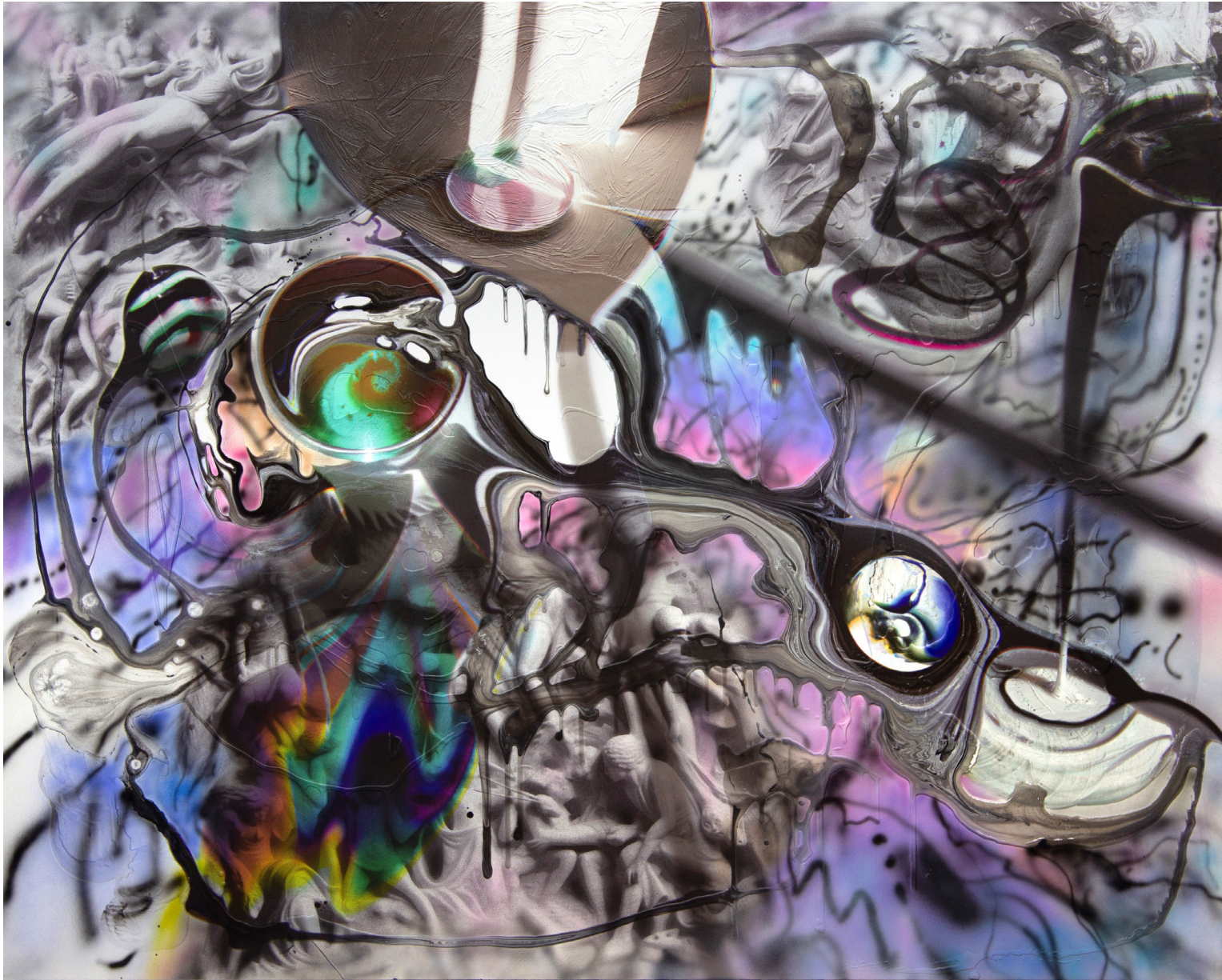
Alex Sutcliffe, Peering, Acrylic, ink, and diffusion-generated imagery UV printed on aluminum composite, 48x60 in. Unframed 2024 CAD 5,400