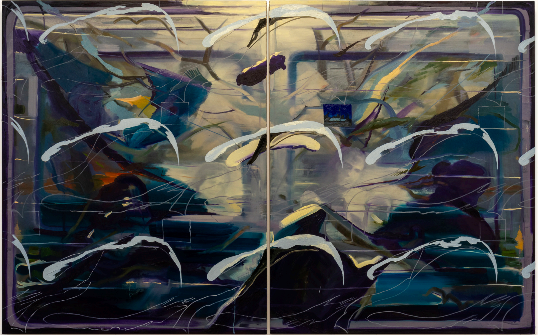
Atticus Gordon, Networked Sublime, Oil on Canvas, 97x60 in. (Diptych), 2023 CAD 5,975