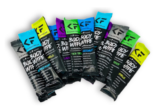
Mixed Flavour pack