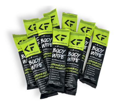
Lemongrass and Citronella