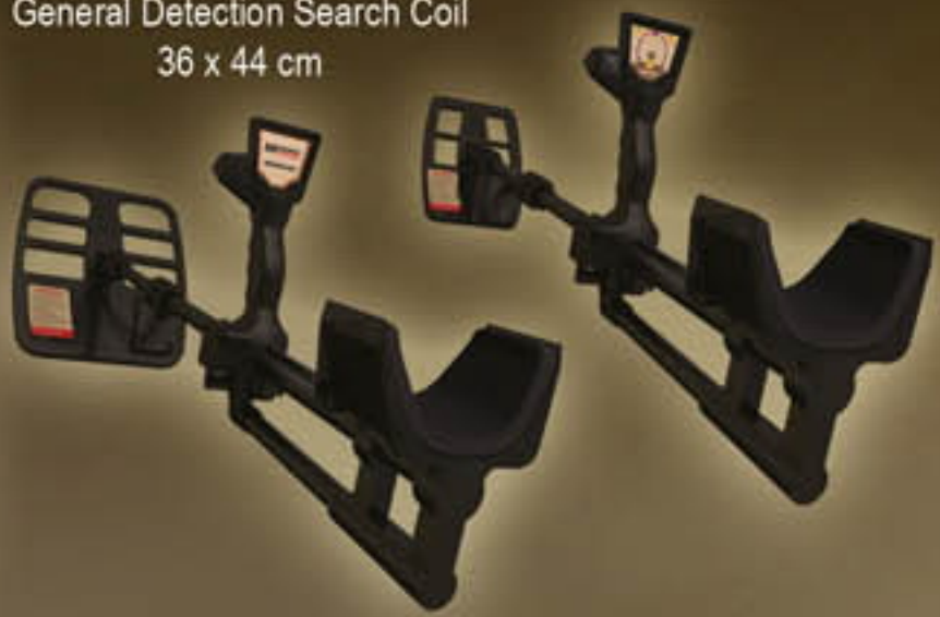
General Detection Search Coil 36 x 44 cm