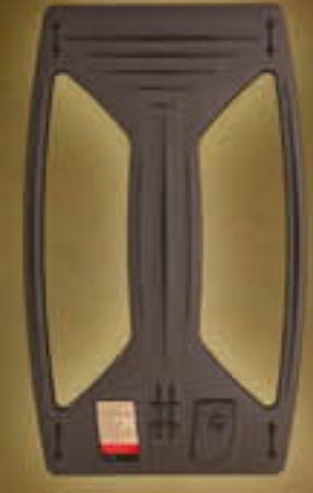
Deep Search Coil