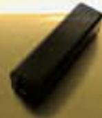
Lithium Polymer Battery