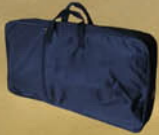
Condura Plastic carrying bag for all the equipments

When metals remain under the ground for a long time, in the pace of time they establish a magnetic field and these magnetic fields radiate as transmitters meaning, the receiver of the search coil ensures detection of the same target in 3 to 4 times deeper.