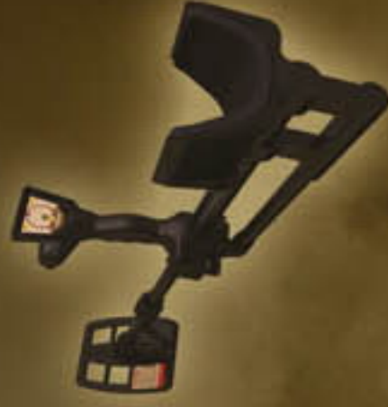
Surface Search Coil