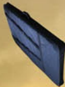
Double zippered Condura plastic carrying bag reinforced for deep search coil