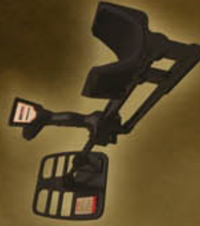
General Search Coil