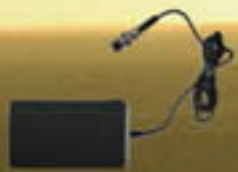
Universal AC charger 100 - 240 Volt, 50 and 60 Hz