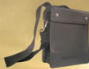
System box leather bag