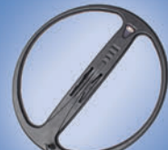
C45 Coil (Pro Package) 39x45 cm (15.5"x17.5") 850 gr (1.9 lb.) (30 oz.)