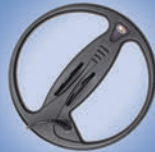
C28 Coil (Standard Package) 28 cm (11") 550 gr (1.2 lb.) (19.4 oz.)