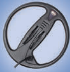
C23 Coil (Pro Package) 23 cm (9") 460 gr (1 lb.) (16 oz.)