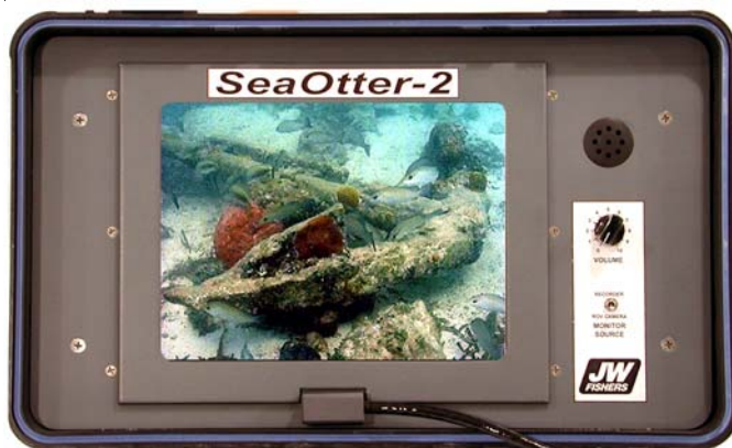
Control Box cover with monitor can be removed for custom positioning or mounting

The SeaOtter-2 sends its video picture to a topside 10.4 inch high resolution ultra-bright color monitor which is built into the Control Box cover. A video output in the Control Box allows an additional remote monitor to be used simultaneously. An adjustable video amplifier on the Control Panel allows operator adjustment of the video picture to optimize picture quality for water clarity. A VCR/DVD can be connected to the Control Box to make a permanent record. The Control Box also contains an audio amplifier with an input jack on the Control Panel for audio recording.