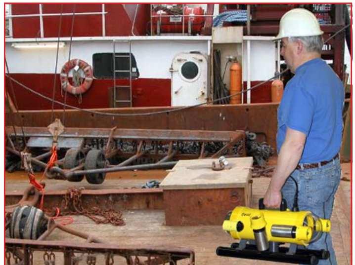
Fishers ROVs are in commercial use Worldwide

At 43 lbs, the ROV is highly portable and very "user friendly". With the optional spare parts kit, the ROV is completely field maintainable. Carrying case is included. JW Fishers SeaOtter-2 ROV system represents a major breakthrough in cost/performance for a commercial grade ROV. This high performance system competes with systems more than twice the price. The SeaOtter-2 is covered by a TWO YEAR WARRANTY.