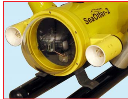
Pan and Tilt Cameras (front and back) with 100 watts of Lighting

Illumination is provided by two, 50 watt operator controlled tungsten halogen lamps for the front camera and "ultra-bright" LED cluster for the rear camera.