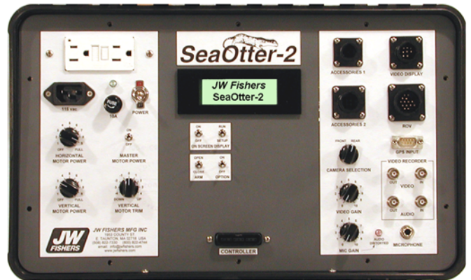
Control Panel's switches, controls, and interface connectors

The Control Panel also contains a LCD readout which displays the overall status of the system.