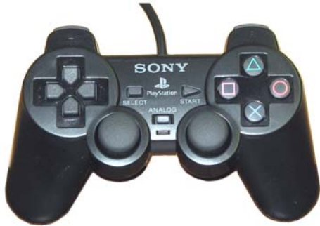
A PS2 Controller's joysticks and buttons control the ROV

The ROV has a sophisticated four motor propulsion system; two motors for forward and reverse, and two motors for vertical and lateral thrust. All motors are reversible and operate at variable speeds. An off-the-shelf PS2 controller (supplied) controls the system. A joystick controls the horizontal motors (forward/reverse and turning) - it can hover "in place" and rotate 360 degrees; and the second joystick controls the vertical motors (up/down and lateral movement). A wireless PS2 controller can also be used.