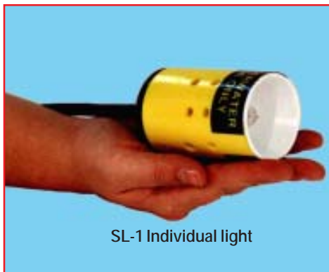
SL-1 Individual light