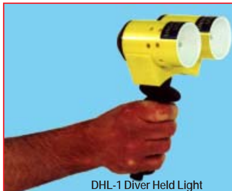
DHL-1 Diver Held Light