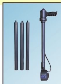
Boat Deployment Kit