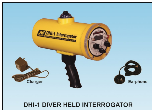
DHI-1 DIVER HELD INTERROGATOR