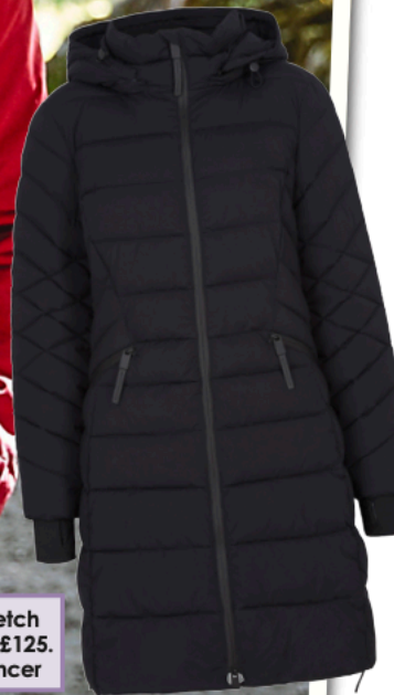
► Comfort Stretch Padded Coat. £125. Mark's & Spencer