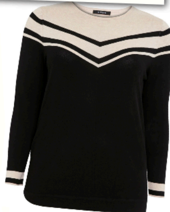
▲ Beige Chevron Jumper. £32. Evans

cellular protection. This dual combination will brighten and illuminate the skin, reduce pigmentation and offer long term protection for the skin.