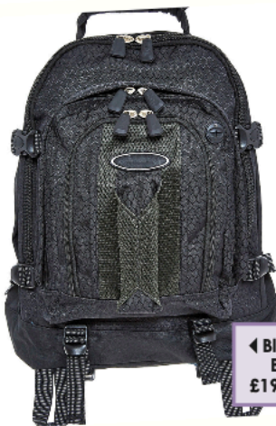
◀ Black Outdoor Backpack. £19.99. TK Maxx