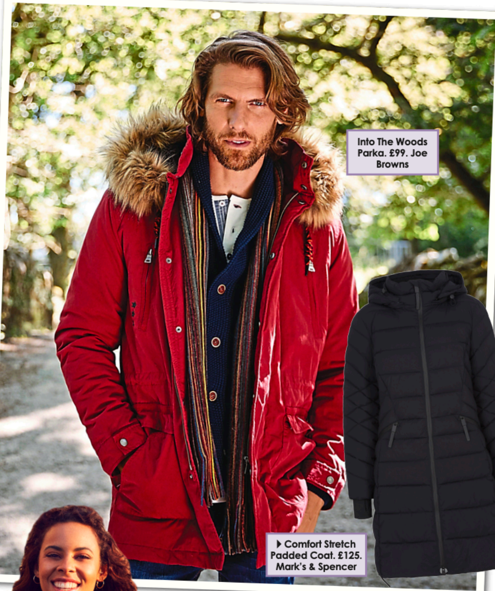
Into The Woods Parka. £99. Joe Browns