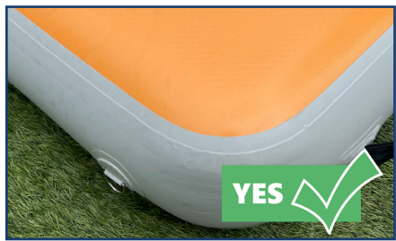
Proper inflation is key to safety and preventing damage

The ideal pressure is different from person to person, and varies based on weight, skill, and desired activity. Test the pressure of the adventure board by standing on it to feel it, and ensure that when you jump you do not come into contact with the ground. If you are unsure if there is enough air, add more.