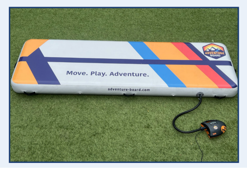
STEP 6: Inflate until adventure board is fully inflated