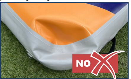
Do not over or under-inflate.