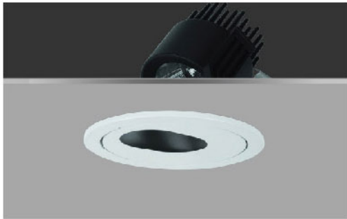
LR16 Milan Series

Wattage: 12-35W Lumen: 1200-3000lm Beam Angle: 15° / 25° / 40°