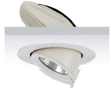
Drop Zone Series

Wattage: 12W Lumen: 1100lm Beam Angle: 15° / 24° / 40°