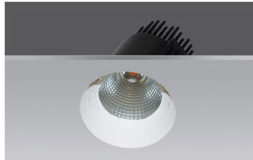
LR16 Milan Series Trimless

Wattage: 12W Lumen: 1100lm Beam Angle: 15° / 24° / 40°