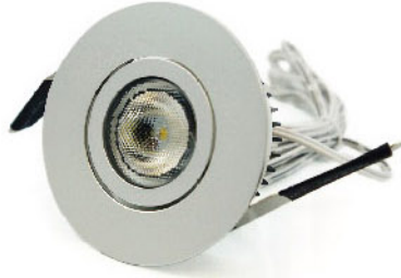
Gimbal 2 | Wattage: 8W Lumen: 720lm Beam Angle: 20° / 30° / 45°