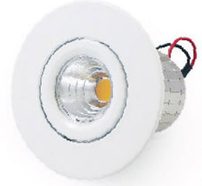
LR16-4 | Wattage: 12W Lumen: 1100lm Beam Angle: 25° / 40° / 50°