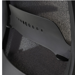
Black mesh backrest, with lumbar support adjustment