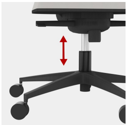
Stepless gas lift height adjustment