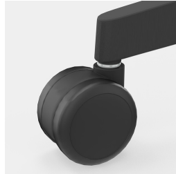
Load-dependent braked safety casters prevent unintentional rolling away