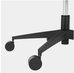
Elegant, sturdy black plastic base