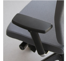
Height adjustable armrests