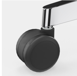
Load-dependent braked safety casters prevent unintentional rolling away