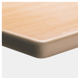
Optional melamine coated table top with ASSODUR® edge