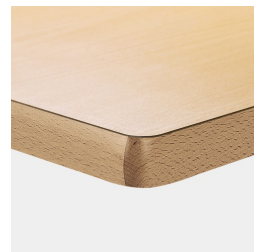
Optional melamine coated table top with solid wood edge