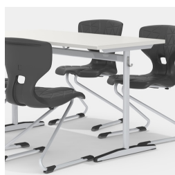
Seating on both sides due to central column frame