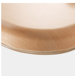
Optional WOODMARK table top in shatterproof quality