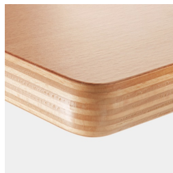
Optional table top multiplex melamine coated