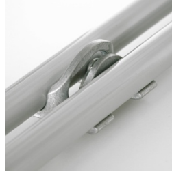
Optionally with row connection from size 5