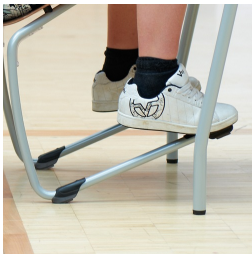
Robust C-shape frame with A2S FLOORSAFE® floor protectors