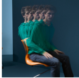
3D movement through Z-frame supports the toning of the muscles