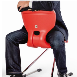
Shell shape allows different sitting positions, including reverse