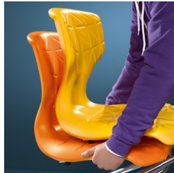
2 chairs stackable and easy to carry due to low weight