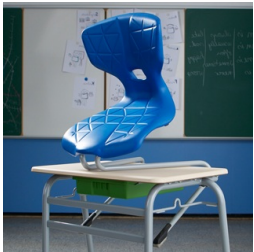
Plate protectors protect the table when stacking up