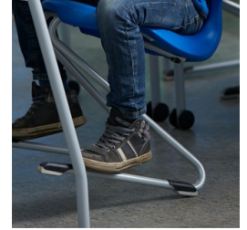
Robust Z-shape frame with A2S FLOORSAFE® floor protectors