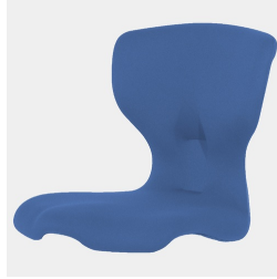
Optional seat shell fully upholstered from size 5 onwards