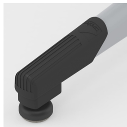
Floor protector with integrated step protection and level compensation