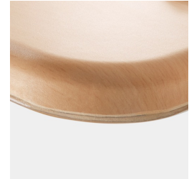
Optional WOODMARK table top in shatterproof quality