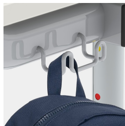
Includes one double satchel hook per seat