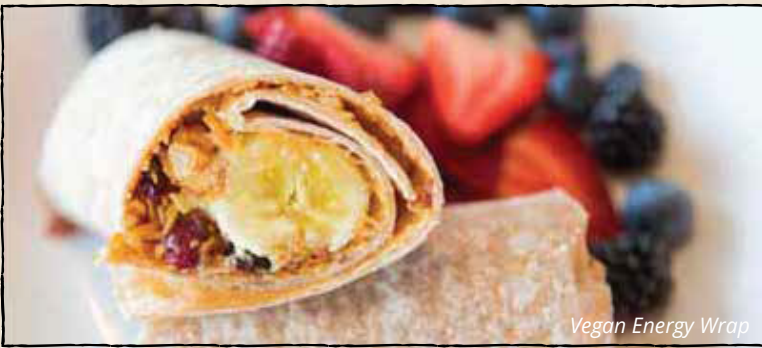
Vegan Energy Wrap