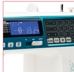
Easy Navigation and LCD Screen