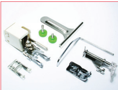
Quilting Set Included