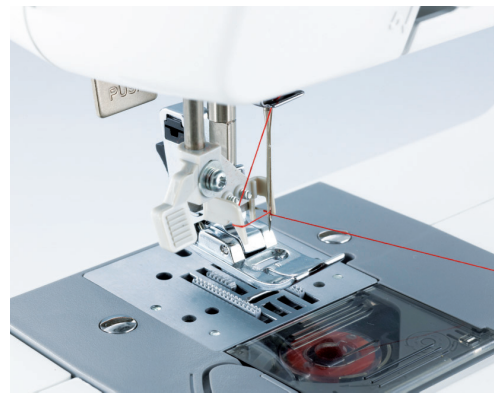
Easy Threading System