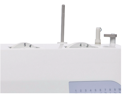
Stitch length and width control

Wide range of optional accessories available including quilting feet, etc. See your dealer or visit www.brother.com for details.