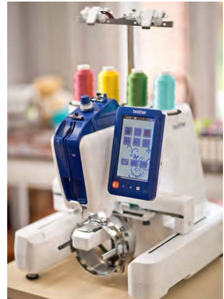
Cap frame shown is an additional purchase.

More creation, less work - the bobbin sensor will tell you when the thread is broken or has run out. While anytime access lets you change the lower bobbin without removing your project.