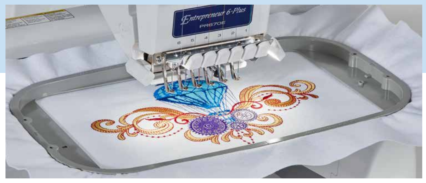
Large embroidery area (300 x 200 mm)

The PR670E embroidery machine is the perfect choice for a small or home-based business and sewing enthusiasts. Its quick set up and fast multi-needle embroidery enables you to embroider large multi-coloured designs with minimum thread changes and greatly increased productivity compared to traditional single-needle machines. Plus, you can enjoy more creativity with its customisation features.