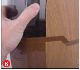
Lift the Water Tank with both hands using the Handle and replace on the humidifier base. Make sure to follow the shape of the Water Tank and the humidifier Base, so that the tank sits level and flush to the Base. Ensure the tank is firmly seated.

(1) WARNING: DO NOT place Water Tank on the humidifier Base if the cap is leaking.