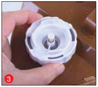
Turn the Water Tank upside down and remove the Tank Cap by turning it counter clockwise.