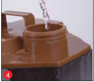
Filling the Water Tank: Use clean, cool water. (1) WARNING: DO NOT use extremely cold water, since it may temporarily reduce the mist output. (1) WARNING: NEVER fill with hot/warm water or use additives as this could damage the unit and void the warranty. (1) WARNING: If you have hard tap water use our Humidfier Demineralization Filters (available at www.Air-Innovations.com) or use ONLY filtered/distilled water.