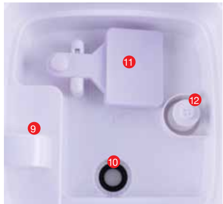
Water Reservoir / Base