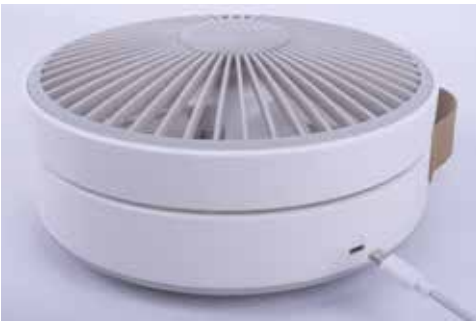
USB-C Cable Included