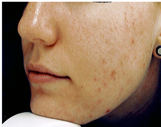
Figure 1 Subject photo before use of omega-3 poly-nutrient capsules

Based on the AIOS evaluations, the omega-3-based intervention did seem to make a difference in mental outlook