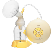
Breast Pump (Medela Swing)