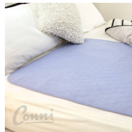
Connie Waterproof and Absorbent Bed Pad