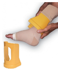
Ezy As Stocking Frame