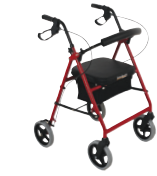
Rollator / Walking Stroller