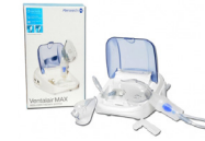
Asthma Pump (Ventair)