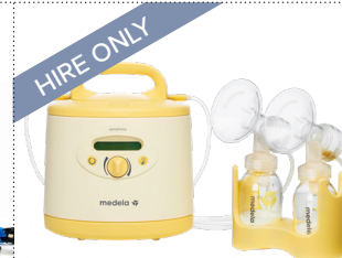
Breast Pump (Medela Symphony)