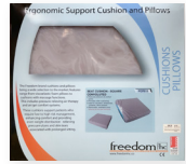
Ergonomic Support Cushion and Pillows