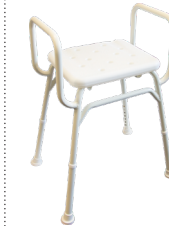
Shower Stool with Arms