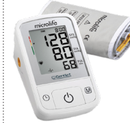
Blood Pressure Machine