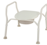
Over Toilet Aid