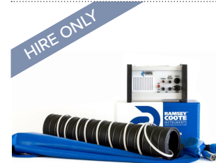
Bed Wetting Monitor