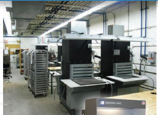
M36 PAC Downdrafts

The casters allow for portability and a dust dump tray helps collect any larger particles. It is a simple, cost-effective unit with a proven track record in all types of industrial air filtration applications.