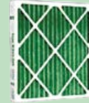
Pleated Panel Filter