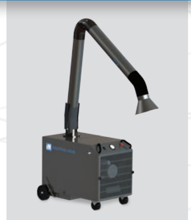
PFC8 with Cartridge Filter

Industrial Maid portable fume extractors can also be fitted with an activated carbon filter which removes gases, or a 99.97% HEPA for removal of Hexavalent Chromium and other nasty pollutants. Also available is an optional 32" x 36" downdraft bench in lieu of the arm. Additional features include, easy access filter service door, tool-less filter change out and removable dust tray.