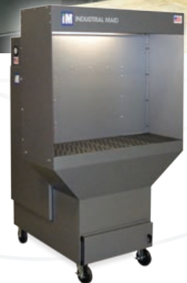
M36 PAC Hood Enclosure