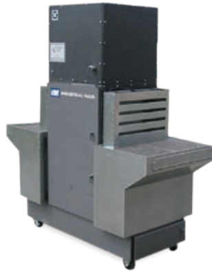
M36 PAC Dual Downdraft