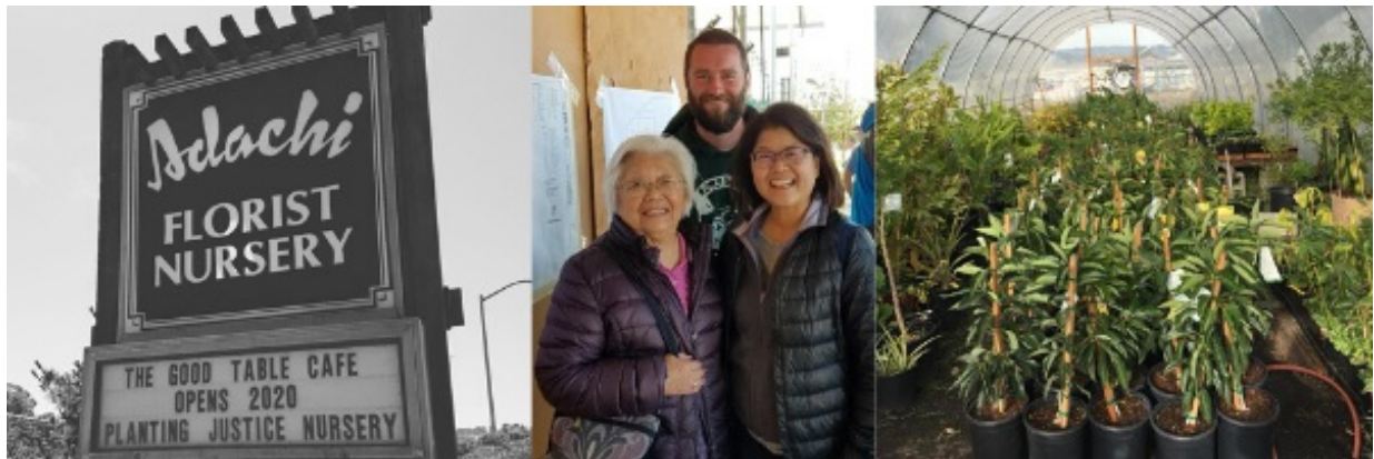
Left: Current sign at the corner of Appian and Valley View Rd in El Sobrante.