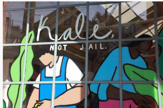
Check out our mural at SF Patagonia!