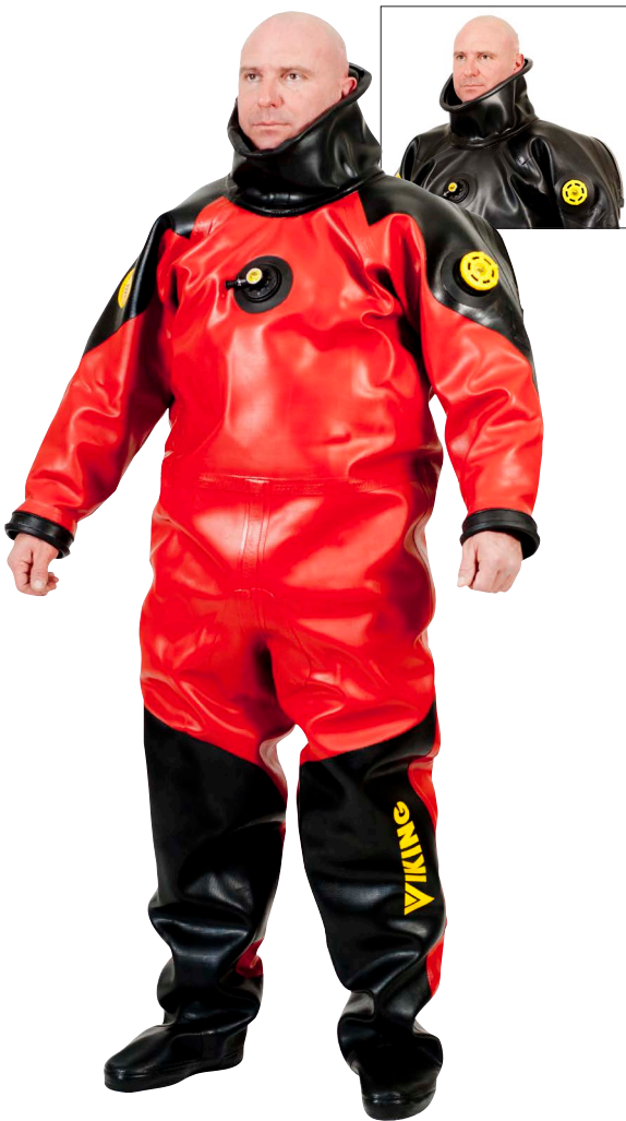
VIKING™ HD with SL27 yoke (inset shows black suit with SL27 yoke).

The VIKING™ HD is considered to be the industry standard for commercial diving worldwide. The suit material is as it suggests, heavy duty, built to withstand the rigours of diving in a harsh working environment. Whether the job is cleaning a ships hull, carrying out welding and inspection, or clearing a fouled propeller, the VIKING™ HD is equal to these tasks and more.