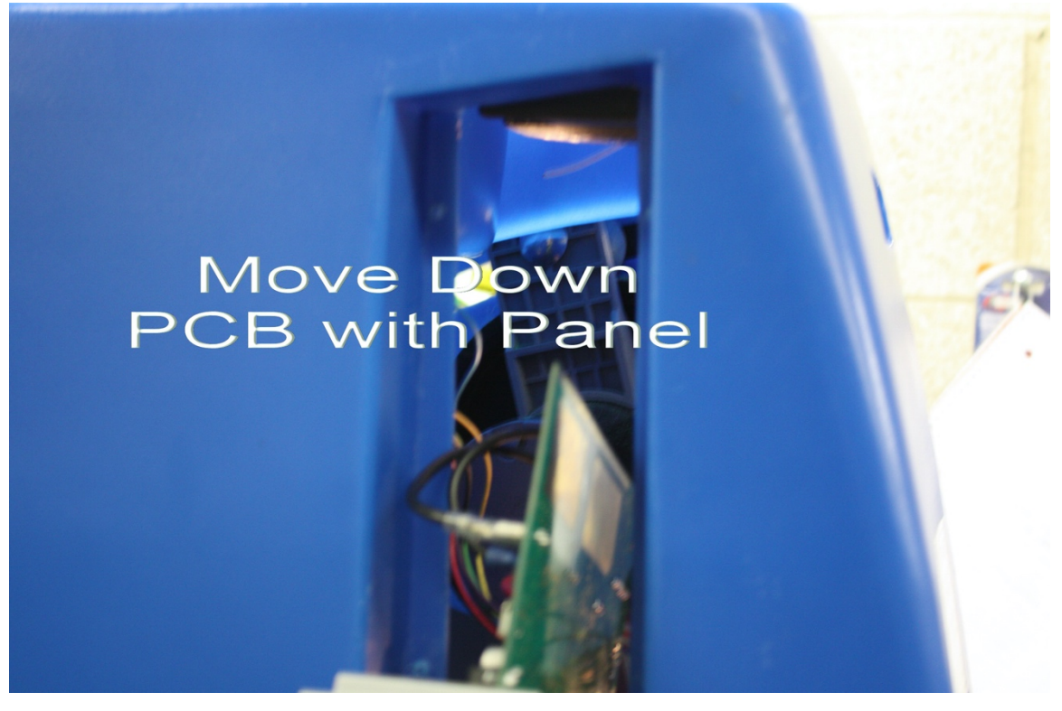
B. Move Down PCB with Panel