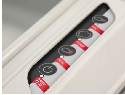
Touch control panel