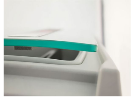
Modern Italian design