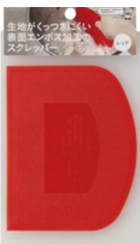
KAI Japanese Multipurpose Dough Scraper