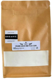
Organic Bread and Pizza Flour - 1kg