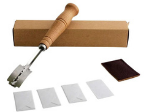
Scoring Knife with 5 Durable Blades and Leather Protective Cover