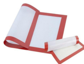
Silicone Non-Stick Baking Mat - 30cm x 40cm