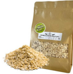
Organic Gluten Free Rolled Oats - 500g