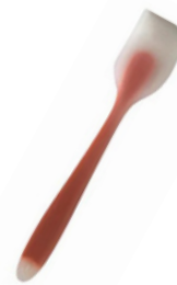
Silicone Seamless Spatula (Mini size)