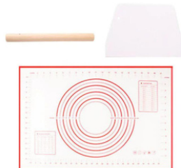
Baking Starter Set