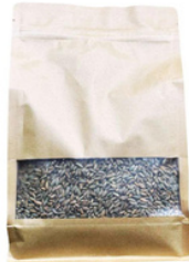
Organic Sprouted Whole Grain Rye Berries - 1kg