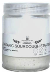
Organic Sourdough Starter - 80g