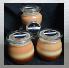
Sweet Delight (SD)

Our three layered citrus delight starts with lemon, then transitions to lime, finishing with our sweet orange fragrance