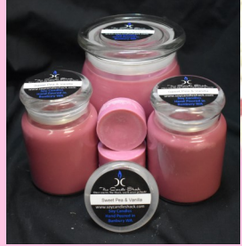
<u>Sweet Pea & Vanilla</u> (SPV)

This floral bouquet is reminiscent of the classic rose garden.