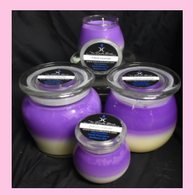
<u>French Lavender</u> <u>(FL)</u>