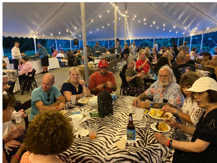
A few of our friends enjoying the 2nd annual fundraiser at Southwick's ZOO