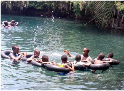
Kids having a great time.

We took the children twice to the Chemka hot springs which really is a beautiful little swimming spot to get them used to being in the water which they all love.