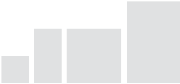
300 X 300 600 X 300 600 X 600 900 X 600