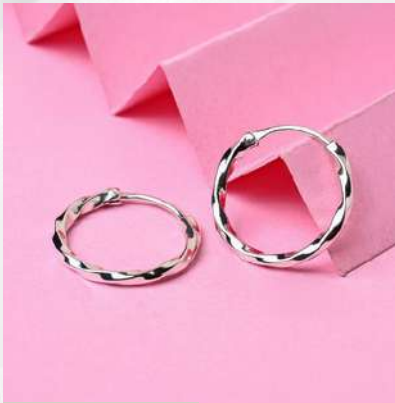
PRODUCT CODE: #SER-019