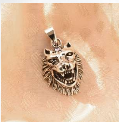
PRODUCT CODE: #SP-004

Material – 925 Sterling Silver Weight Range – 3.6 gram