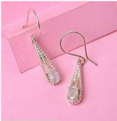
PRODUCT CODE: #SER-014

Available with various stones Material - 925 Sterling Silver Weight Range - 4 gram Stone - Amethyst