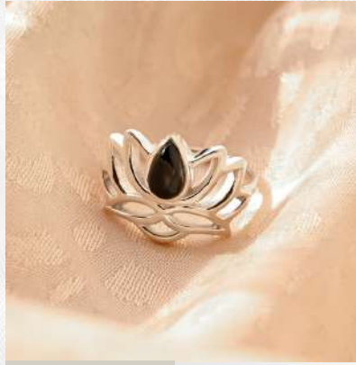
PRODUCT CODE: #SR-002

Material - 925 Sterling Silver Weight Range - 3 gram