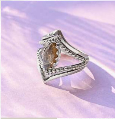
PRODUCT CODE: #SR-046