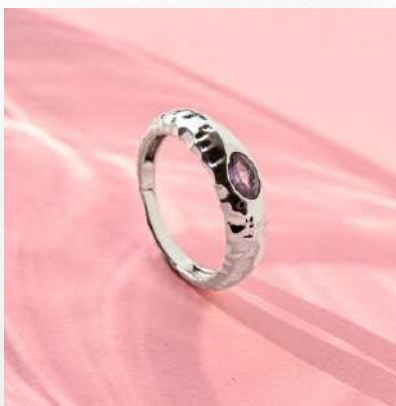
PRODUCT CODE: #SR-060

Available in various sizes Material - 925 Sterling Silver Weight Range - 4.8 gram