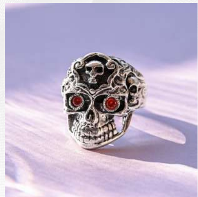
PRODUCT CODE: #SR-051

Material - 925 Sterling Silver Weight Range - 8 gram