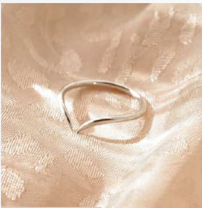
PRODUCT CODE: #SR-034

Material – 925 Sterling Silver Weight Range – 0.96 gram Stone – Cubic Zirconia