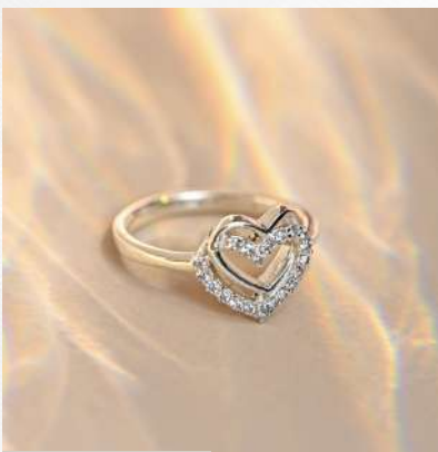
PRODUCT CODE: #SR-007

Material - 925 Sterling Silver Weight Range - 2.65 gram Stone - Amethyst