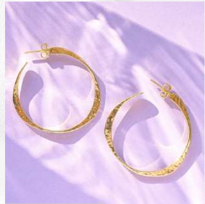
PRODUCT CODE: #SER-030

Available in various stones Material – 925 Sterling Silver Weight Range – 4 gram Stone – Garnet