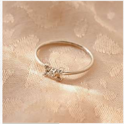
PRODUCT CODE: #SR-021

Material - 925 Sterling Silver Weight Range - 1.5 gram Stone - Cubic Zirconia