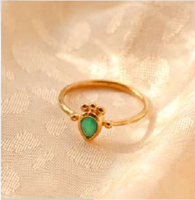
PRODUCT CODE: #SR-010