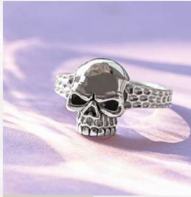
PRODUCT CODE: #SR-047

Material - 925 Sterling Silver Weight Range - 5.9 gram Stone - Labrodorite