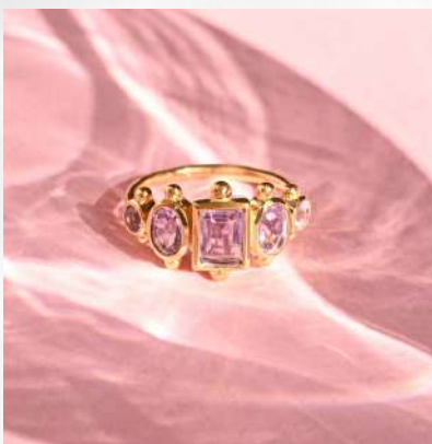
PRODUCT CODE: #SR-056

Available in various stones & sizes Material - 925 Sterling Silver Weight Range - 8.6 gram Stone - Turquoise