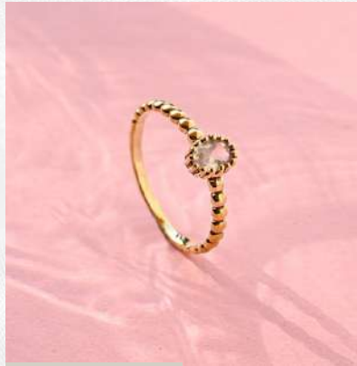
PRODUCT CODE: #SR-063

Available in various stones & sizes Material - 925 Sterling Silver Weight Range - 2.29 gram Stone - Black Onyx