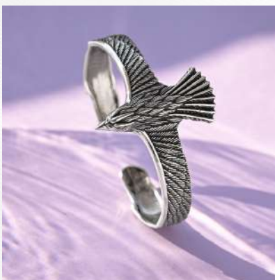
PRODUCT CODE: #SEB-002

Available in various sizes Material – 925 Sterling Silver Weight Range – 20 gram