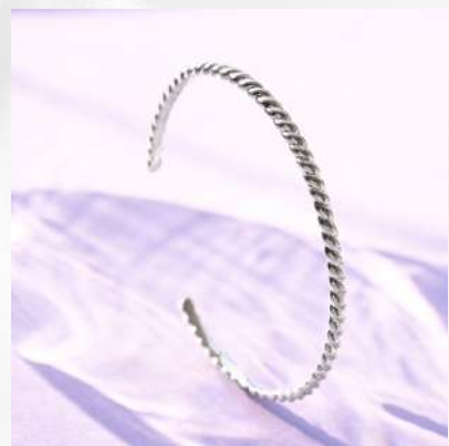
PRODUCT CODE: #SEB-004

Available in various sizes Material – 925 Sterling Silver Weight Range – 16 gram