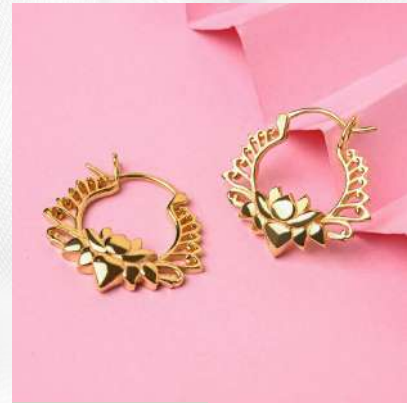
PRODUCT CODE: #SER-021

Material – 925 Sterling Silver Weight Range – 3.6 gram