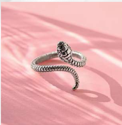
PRODUCT CODE: #SR-053