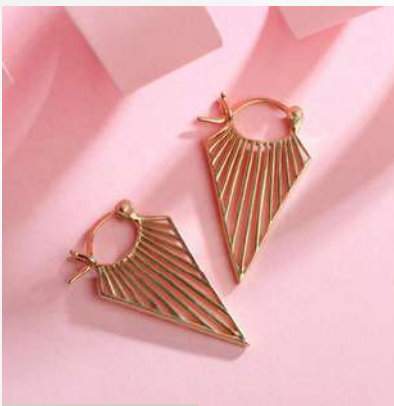
PRODUCT CODE: #SER-016

Material - 925 Sterling Silver Weight Range - 3 gram