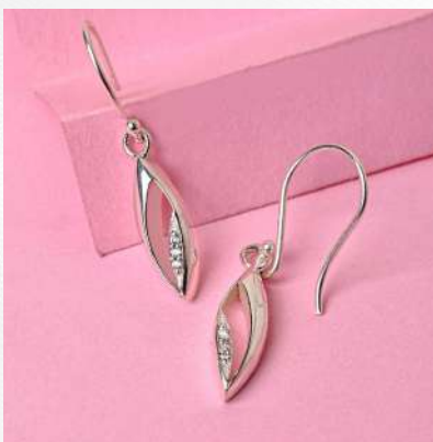
PRODUCT CODE: #SER-025

Material – 925 Sterling Silver Weight Range – 7.6 gram