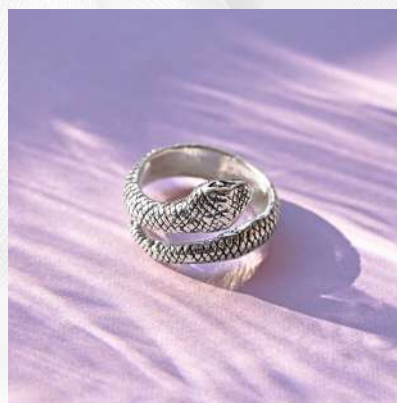
PRODUCT CODE: #SR-039

Material - 925 Sterling Silver Weight Range - 15.6 gram