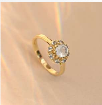
PRODUCT CODE: #SR-016

Material - 925 Sterling Silver Weight Range - 3.8 gram