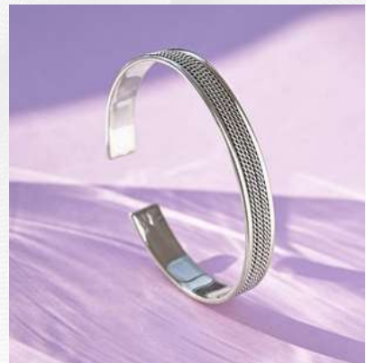
PRODUCT CODE: #SEB-001

Material – 925 Sterling Silver Weight Range – 5.85 gram