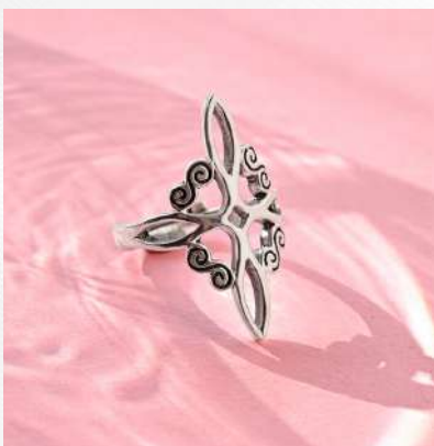
PRODUCT CODE: #SR-059

Available in various sizes Material - 925 Sterling Silver Weight Range - 1.8 gram Stone - Cubic Zirconia