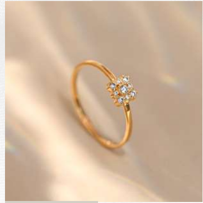
PRODUCT CODE: #SR-033

Material – 925 Sterling Silver Weight Range – 1.30 gram Stone – Cubic Zirconia