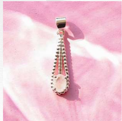
PRODUCT CODE: #SP-023

Material – 925 Sterling Silver Weight Range – 2.75 gram Stone – Amethyst