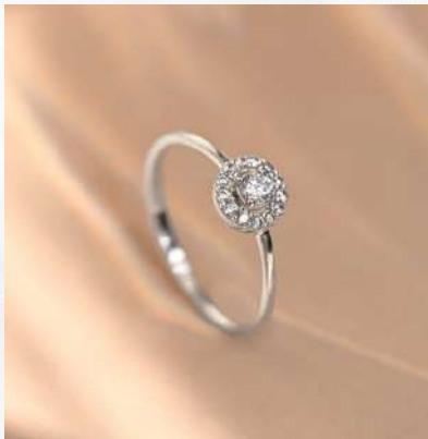
PRODUCT CODE: #SR-014

Material - 925 Sterling Silver Weight Range - 4.75 gram