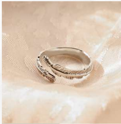
PRODUCT CODE: #SR-005

Material - 925 Sterling Silver Weight Range - 1 gram Stone - Cubic Zirconia