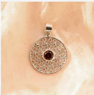
PRODUCT CODE: #SP-002

Material – 925 Sterling Silver Weight Range – 2.6 gram Stone – Cubic Zirconia