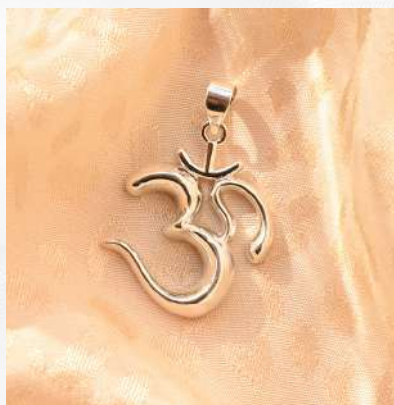
PRODUCT CODE: #SP-013

Material – 925 Sterling Silver Weight Range – 11 gram