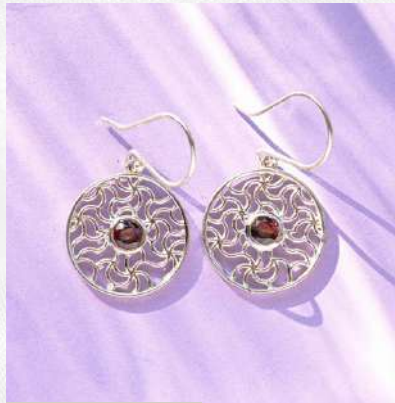
PRODUCT CODE: #SER-029

Material – 925 Sterling Silver Weight Range – 6.75 gram