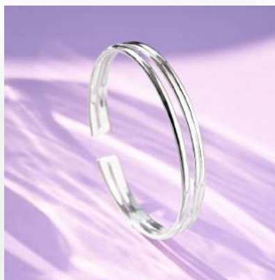
PRODUCT CODE: #SEB-003

Available in various sizes Material – 925 Sterling Silver Weight Range – 28 gram