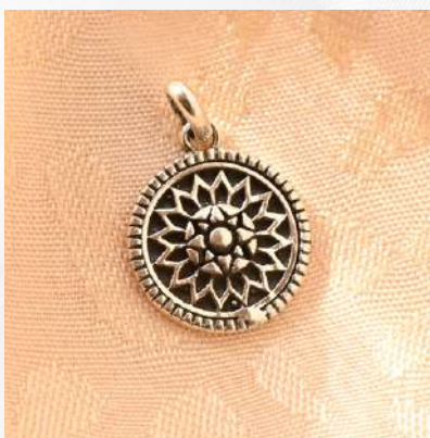
PRODUCT CODE: #SP-005

Material – 925 Sterling Silver Weight Range – 7.65 gram