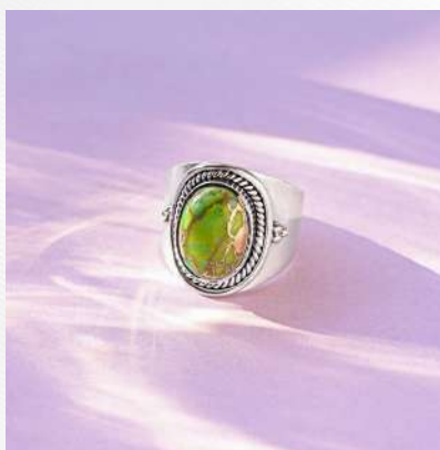
PRODUCT CODE: #SR-043

Material - 925 Sterling Silver Weight Range - 11.5 gram