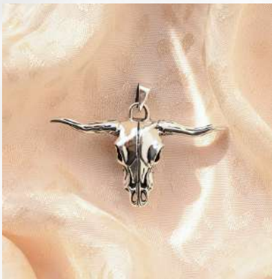
PRODUCT CODE: #SP-012

Material – 925 Sterling Silver Weight Range – 2.15 gram