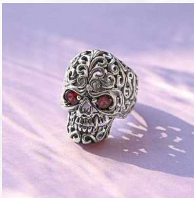
PRODUCT CODE: #SR-041

Material - 925 Sterling Silver Weight Range - 11 gram