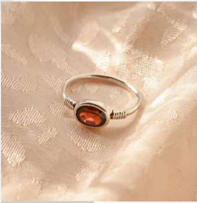
PRODUCT CODE: #SR-019