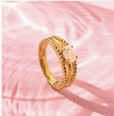
PRODUCT CODE: #SR-066

Available in various stones & sizes Material - 925 Sterling Silver Weight Range - 4.2 gram Stone - Amethyst