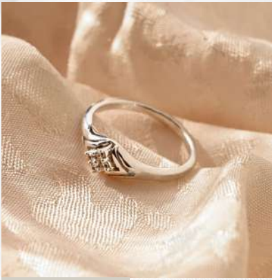
PRODUCT CODE: #SR-028