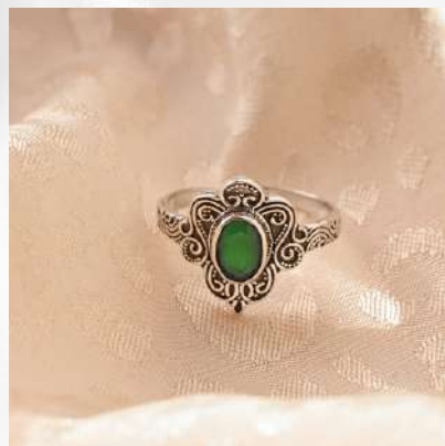
PRODUCT CODE: #SR-018

Material - 925 Sterling Silver Weight Range - 8 gram