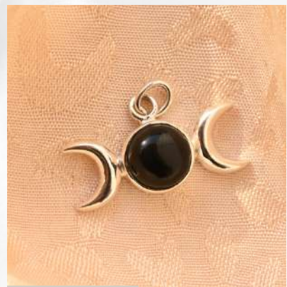
PRODUCT CODE: #SP-017

Material – 925 Sterling Silver Weight Range – 11 gram