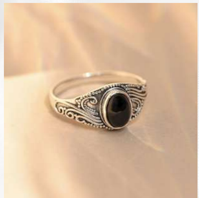
PRODUCT CODE: #SR-027

Material - 925 Sterling Silver Weight Range - 4.35 gram