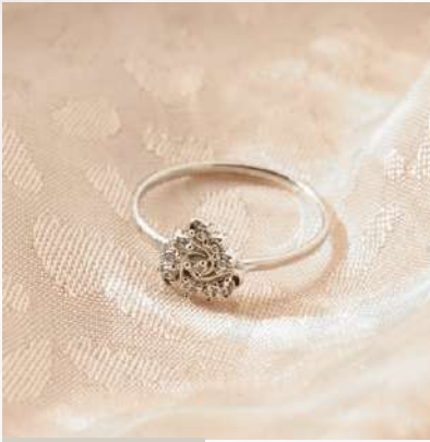
PRODUCT CODE: #SR-031

Material – 925 Sterling Silver Weight Range – 3.09 gram Stone – Black Onyx