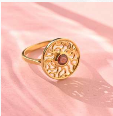
PRODUCT CODE: #SR-057

Available in various stones & sizes Material - 925 Sterling Silver Weight Range - 4.15 gram Stone - Amethyst