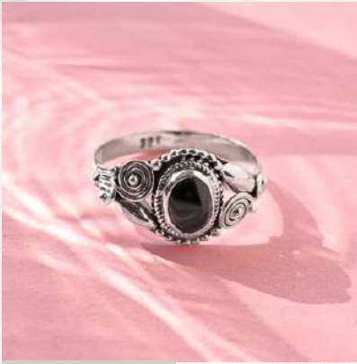
PRODUCT CODE: #SR-062