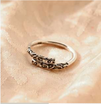
PRODUCT CODE: #SR-001