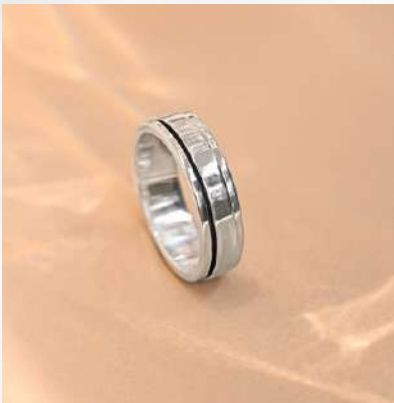
PRODUCT CODE: #SR-013

Material - 925 Sterling Silver Weight Range - 4.2 gram Stone - Blue Topaz