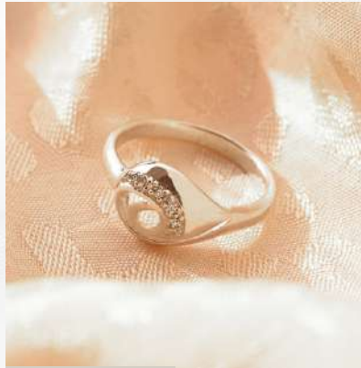
PRODUCT CODE: #SR-023

Material - 925 Sterling Silver Weight Range - 1.1 gram Stone - Cubic Zirconia