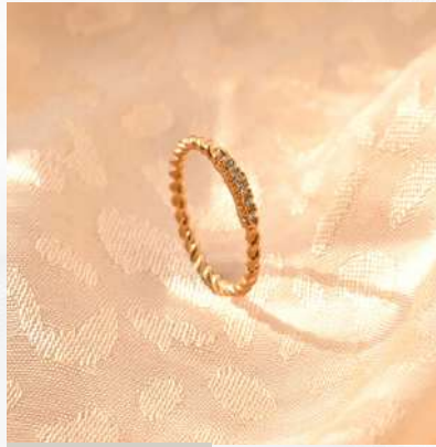
PRODUCT CODE: #SR-032

Material – 925 Sterling Silver Weight Range – 1.24 gram Stone – Cubic Zirconia