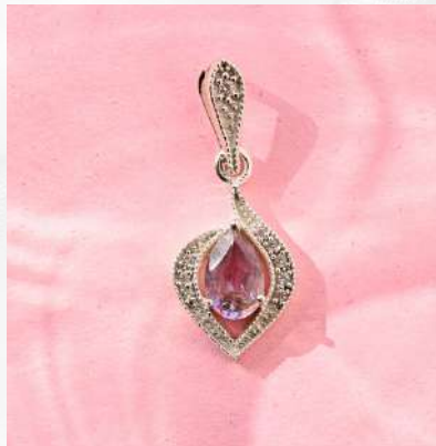
PRODUCT CODE: #SP-022

Material – 925 Sterling Silver Weight Range – 3.6 gram Stone – Cubic Zirconia