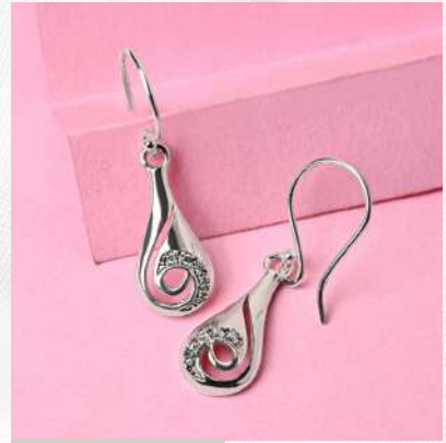
PRODUCT CODE: #SER-012

Material - 925 Sterling Silver Weight Range - 3.25 gram