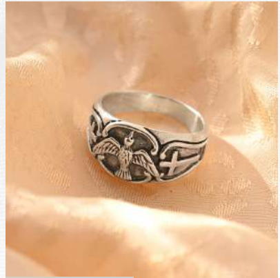
PRODUCT CODE: #SR-024

Material - 925 Sterling Silver Weight Range - 2.1 gram Stone - Cubic Zirconia