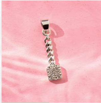
PRODUCT CODE: #SP-019

Material – 925 Sterling Silver Weight Range – 2.75 gram Stone – Turquoise