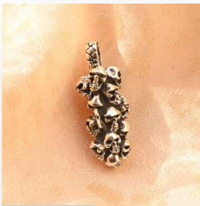
PRODUCT CODE: #SP-016

Material – 925 Sterling Silver Weight Range – 1.4 gram Stone – Cubic Zirconia