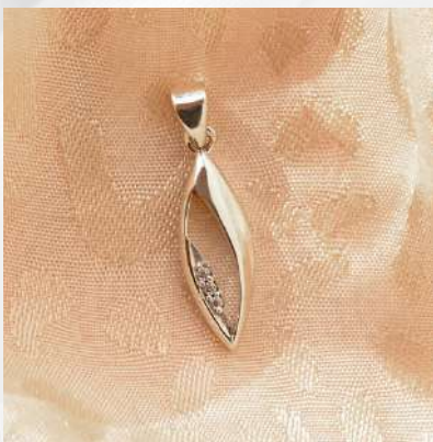
PRODUCT CODE: #SP-001