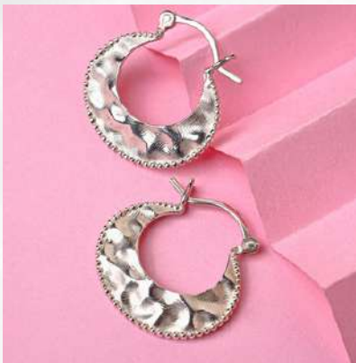
PRODUCT CODE: #SER-022

Material – 925 Sterling Silver Weight Range – 5 gram