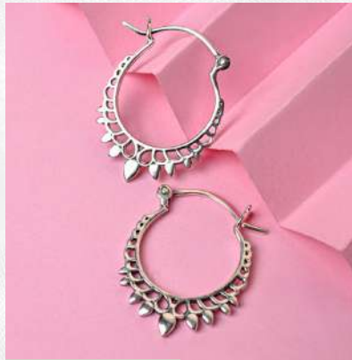
PRODUCT CODE: #SER-020

Material – 925 Sterling Silver Weight Range – 1.8 gram