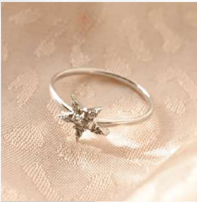
PRODUCT CODE: #SR-004

Material - 925 Sterling Silver Weight Range - 3.25 gram