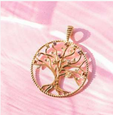
PRODUCT CODE: #SP-021

Material – 925 Sterling Silver Weight Range – 1.4 gram Stone – Cubix Zirconia