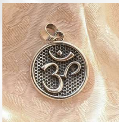
PRODUCT CODE: #SP-008

Material – 925 Sterling Silver Weight Range – 7.1 gram