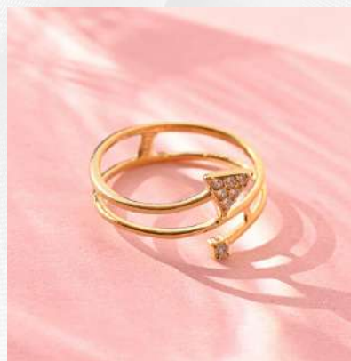
PRODUCT CODE: #SR-058

Available in various stones & sizes Material - 925 Sterling Silver Weight Range - 3 gram Stone - Garnet