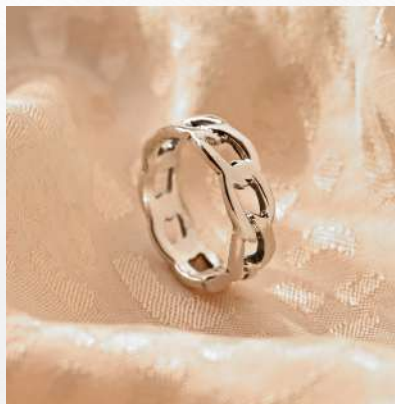
PRODUCT CODE: #SR-026

Material - 925 Sterling Silver Weight Range - 2.35 gram Stone - Cubic Zirconia