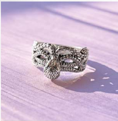
PRODUCT CODE: #SR-049

Material - 925 Sterling Silver Weight Range - 10.1 gram