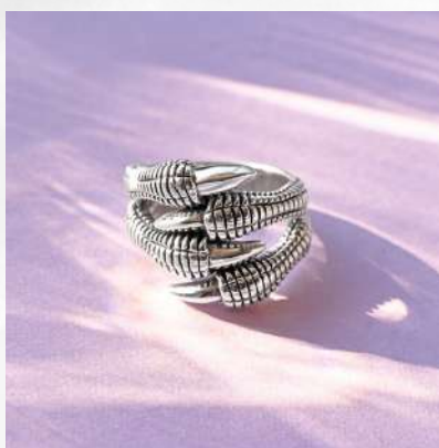
PRODUCT CODE: #SR-040

Material - 925 Sterling Silver Weight Range - 9.15 gram