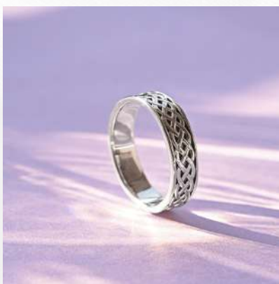
PRODUCT CODE: #SR-044

Material - 925 Sterling Silver Weight Range - 8.65 gram Stone - Copper Turquoise