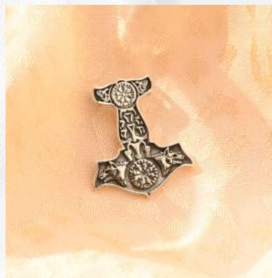
PRODUCT CODE: #SP-003

Material – 925 Sterling Silver Weight Range – 3.5 gram Stone – Garnet