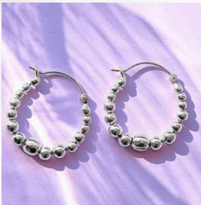
PRODUCT CODE: #SER-031

Material – 925 Sterling Silver Weight Range – 8.4 gram