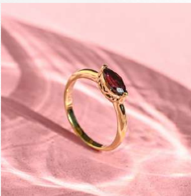
PRODUCT CODE: #SR-068

Available in various sizes Material - 925 Sterling Silver Weight Range - 3.2 gram Stone - Cubic Zirconia and Citrine