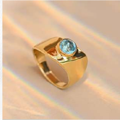
PRODUCT CODE: #SR-012

Material - 925 Sterling Silver Weight Range - 1.75 gram Stone - Rainbow Moonstone