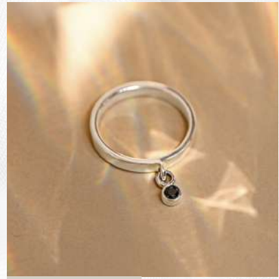
PRODUCT CODE: #SR-030

Material – 925 Sterling Silver Weight Range – 1.74 gram Stone – Cubic Zirconia