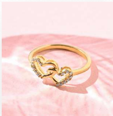
PRODUCT CODE: #SR-069

Available in various stones & sizes Material - 925 Sterling Silver Weight Range - 1.75 gram Stone - Garnet