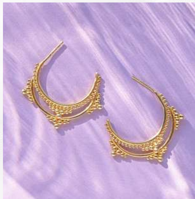
PRODUCT CODE: #SER-032

Material – 925 Sterling Silver Weight Range – 8.8 gram