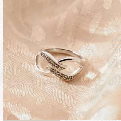
PRODUCT CODE: #SR-003

Material - 925 Sterling Silver Weight Range - 4.6 gram Stone - Black Onyx