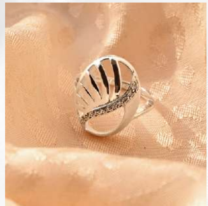
PRODUCT CODE: #SR-070

Available in various sizes Material - 925 Sterling Silver Weight Range - 2.1 gram Stone - Cubic Zirconia