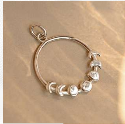
PRODUCT CODE: #SP-011

Available in various stones Material – 925 Sterling Silver Weight Range – 2.85 gram Stone – Cubic Zirconia & Citrine