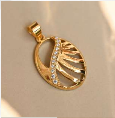
PRODUCT CODE: #SP-009