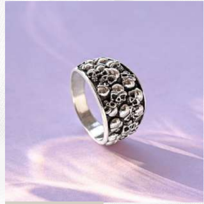
PRODUCT CODE: #SR-048

Material - 925 Sterling Silver Weight Range - 5.65 gram