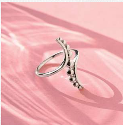
PRODUCT CODE: #SR-054

Available in various sizes Material - 925 Sterling Silver Weight Range - 3.6 gram