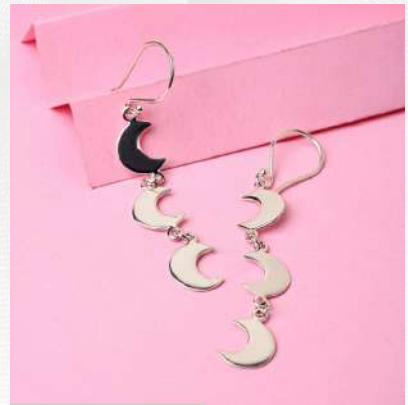
PRODUCT CODE: #SER-015

Available with various stones Material - 925 Sterling Silver Weight Range - 3 gram Stone - Rainbow Moonstone