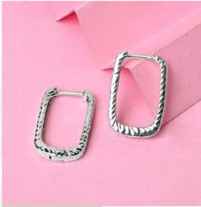
PRODUCT CODE: #SER-011

Available with various stones Material - 925 Sterling Silver Weight Range - 3.2 gram Stone - Peridot