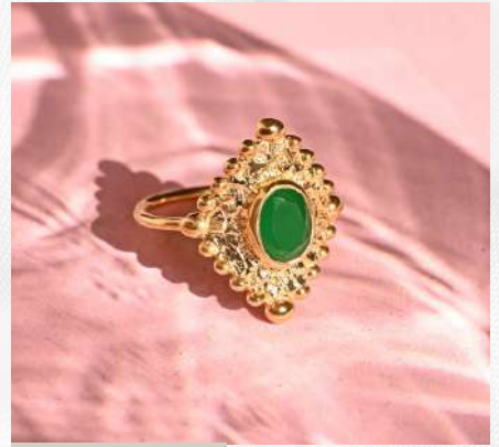
PRODUCT CODE: #SR-064

Available in various stones & sizes Material - 925 Sterling Silver Weight Range - 1.3 gram Stone - Blue Topaz