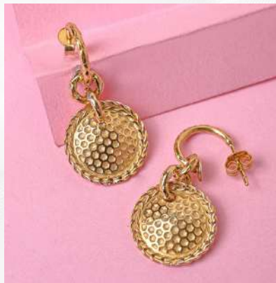
PRODUCT CODE: #SER-023

Material – 925 Sterling Silver Weight Range – 6.15 gram