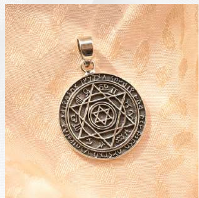
PRODUCT CODE: #SP-014

Material – 925 Sterling Silver Weight Range – 4.3 gram