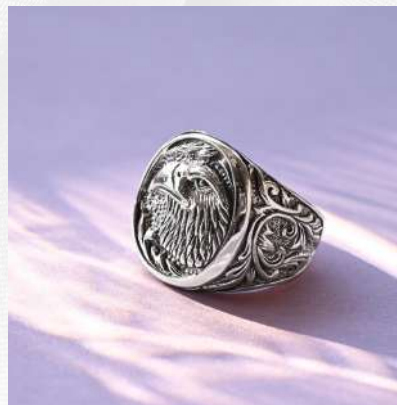
PRODUCT CODE: #SR-042

Material - 925 Sterling Silver Weight Range - 11.1 gram Stone - Garnet