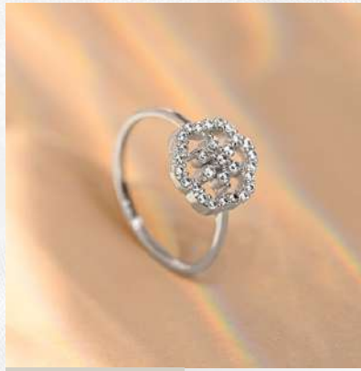
PRODUCT CODE: #SR-029

Material – 925 Sterling Silver Weight Range – 2.36 gram Stone – Cubic Zirconia