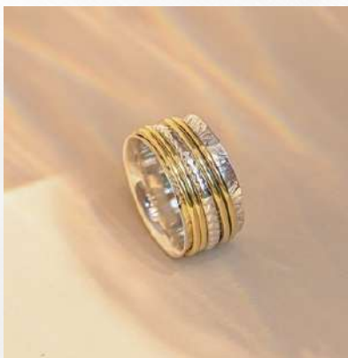
PRODUCT CODE: #SR-017

Material - 925 Sterling Silver Weight Range - 2.1 gram Stone - Rainbow Moonstone