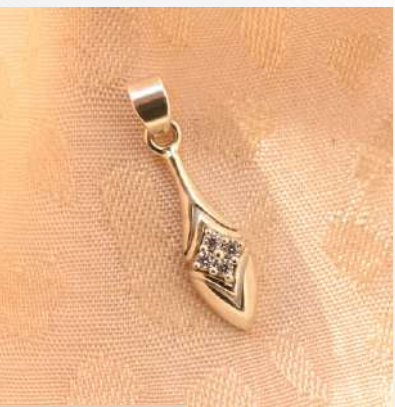
PRODUCT CODE: #SP-015

Material – 925 Sterling Silver Weight Range – 5.25 gram