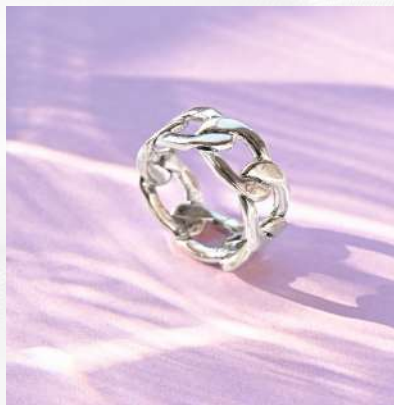
PRODUCT CODE: #SR-050

Material - 925 Sterling Silver Weight Range - 5.75 gram