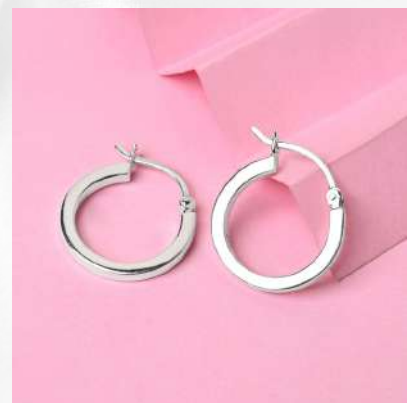
PRODUCT CODE: #SER-027

Material – 925 Sterling Silver Weight Range – 6 gram