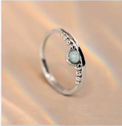
PRODUCT CODE: #SR-011

Material - 925 Sterling Silver Weight Range - 1.75 gram Stone - Green Onyx