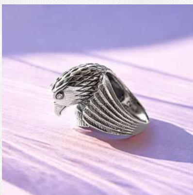
PRODUCT CODE: #SR-038

Material - 925 Sterling Silver Weight Range - 7.8 gram