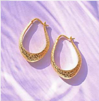
PRODUCT CODE: #SER-028