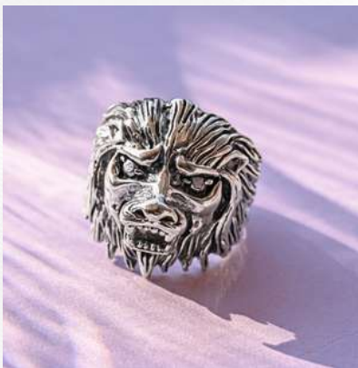
PRODUCT CODE: #SR-052

Material - 925 Sterling Silver Weight Range - 16.8 gram Stone - Garnet