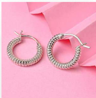
PRODUCT CODE: #SER-026

Material – 925 Sterling Silver Weight Range – 3.6 gram Stone – Cubic Zirconia