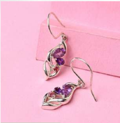
PRODUCT CODE: #SER-013

Material - 925 Sterling Silver Weight Range - 2.4 gram Stone - Cubic Zirconia