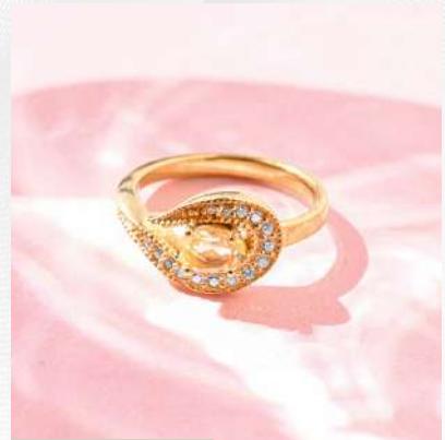
PRODUCT CODE: #SR-067

Available in various stones & sizes Material - 925 Sterling Silver Weight Range - 3.35 gram Stone - Rainbow Moonstone