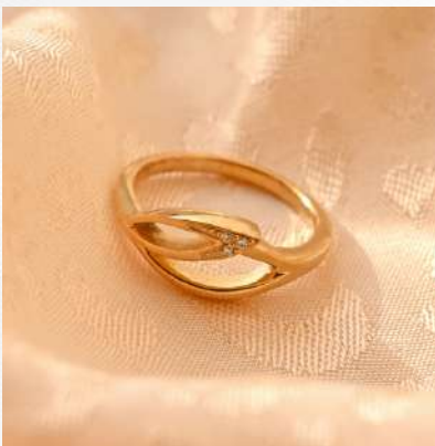
PRODUCT CODE: #SR-025

Material - 925 Sterling Silver Weight Range - 11 gram