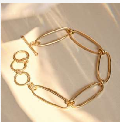
PRODUCT CODE: #SB-007

Material – 925 Sterling Silver Weight Range – 9 gram