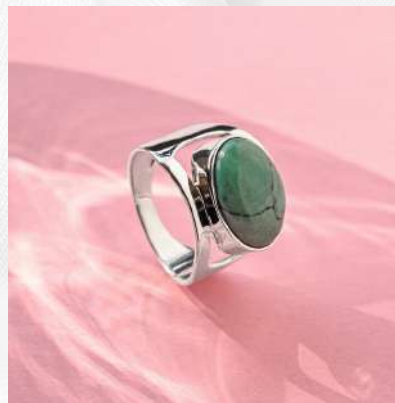
PRODUCT CODE: #SR-055

Available in various sizes Material - 925 Sterling Silver Weight Range - 3.1 gram