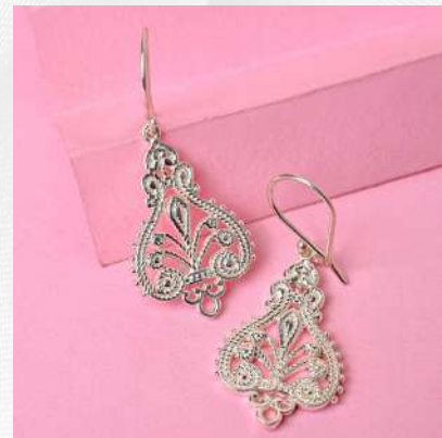
PRODUCT CODE: #SER-024

Material – 925 Sterling Silver Weight Range – 6.9 gram