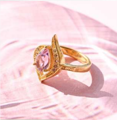
PRODUCT CODE: #SR-065

Available in various stones & sizes Material - 925 Sterling Silver Weight Range - 4.35 gram Stone - Green Onyx