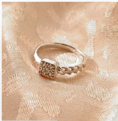
PRODUCT CODE: #SR-035

Material – 925 Sterling Silver Weight Range – 1.60 gram