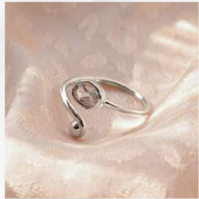
PRODUCT CODE: #SR-006

Material - 925 Sterling Silver Weight Range - 2.65 gram