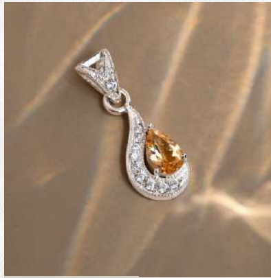
PRODUCT CODE: #SP-010

Material – 925 Sterling Silver Weight Range – 3 gram Stone – Cubic Zirconia