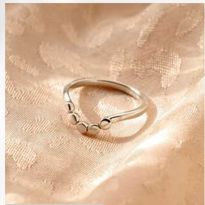
PRODUCT CODE: #SR-036

Material – 925 Sterling Silver Weight Range – 2.02 gram Stone – Cubic Zirconia