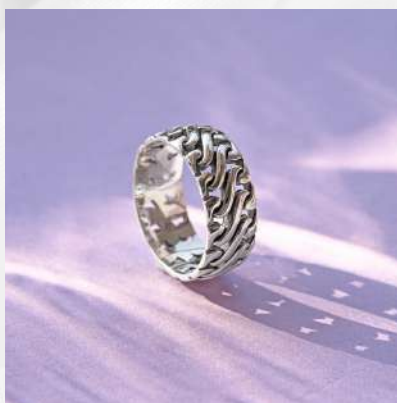
PRODUCT CODE: #SR-037