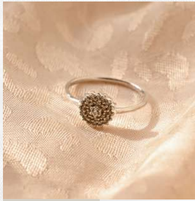
PRODUCT CODE: #SR-020

Material - 925 Sterling Silver Weight Range - 2 gram Stone - Garnet