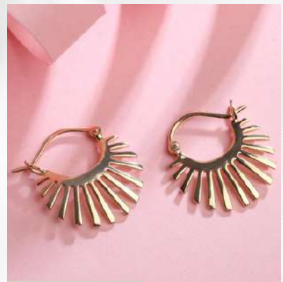
PRODUCT CODE: #SER-018

Material - 925 Sterling Silver Weight Range - 5.25 gram