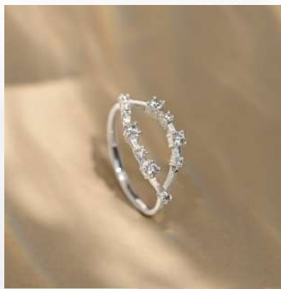
PRODUCT CODE: #SR-008

Material - 925 Sterling Silver Weight Range - 2.65 gram Stone - Cubic Zirconia