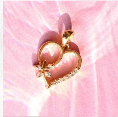
PRODUCT CODE: #SP-020

Material – 925 Sterling Silver Weight Range – 1.2 gram Stone – Cubic Zirconia