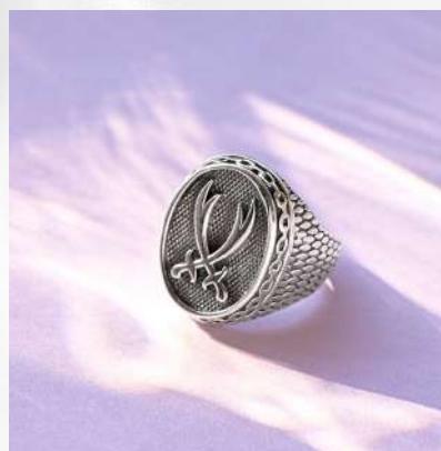
PRODUCT CODE: #SR-045

Material - 925 Sterling Silver Weight Range - 6.6 gram