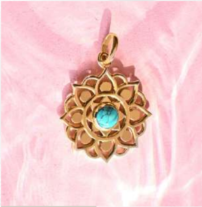
PRODUCT CODE: #SP-018