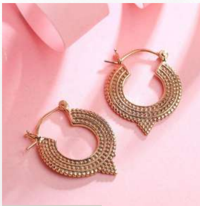
PRODUCT CODE: #SER-017

Material - 925 Sterling Silver Weight Range - 3.75 gram