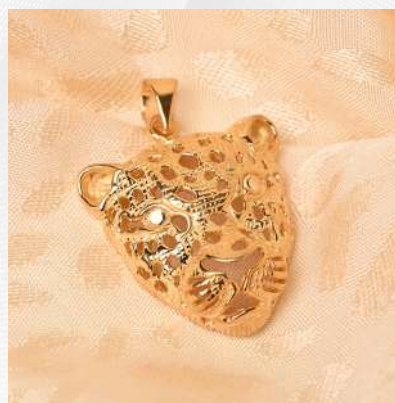
PRODUCT CODE: #SP-006

Material – 925 Sterling Silver Weight Range – 1.9 gram