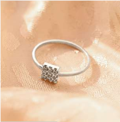
PRODUCT CODE: #SR-022

Material - 925 Sterling Silver Weight Range - 1 gram Stone - Cubic Zirconia