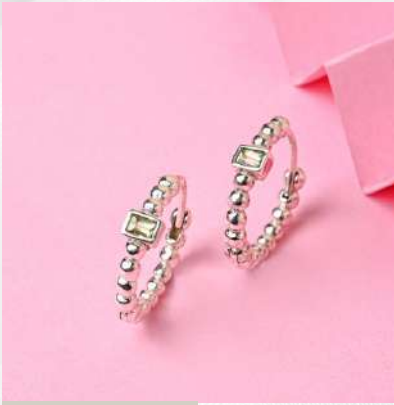
PRODUCT CODE: #SER-010