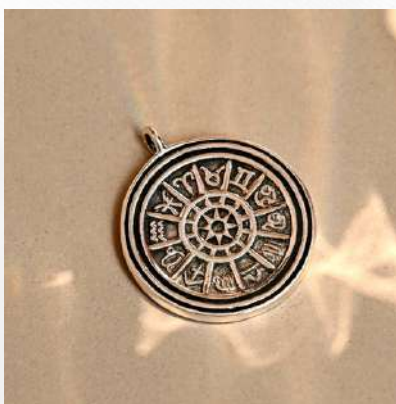
PRODUCT CODE: #SP-007

Material – 925 Sterling Silver Weight Range – 13 gram