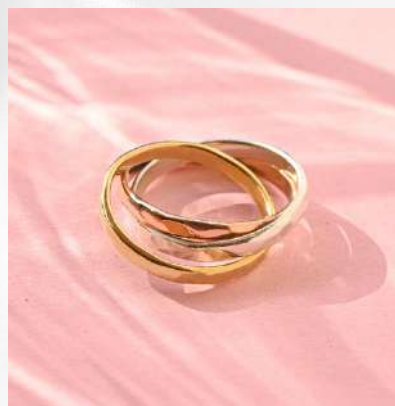
PRODUCT CODE: #SR-061

Available in various stones & sizes Material - 925 Sterling Silver Weight Range - 3.9 gram Stone - Amethyst