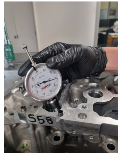
Figure 6 : Measuring Valve Tip Height in the S58 head