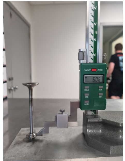
Figure 3: Exhaust Valve

Figures 2 (Intake) & 3 (Exhaust) : Measuring from the valve tip to the underside of the retainer using a height gauge