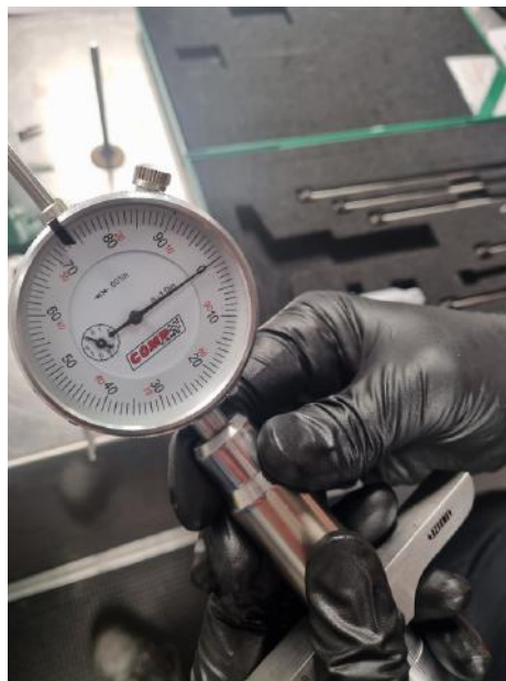
Figure 5 : Calibrating Dial Gauge for Valve Tip Height Measurement