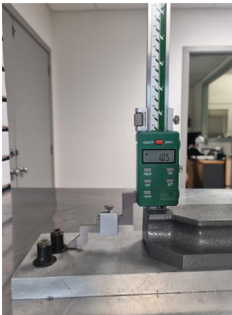
Figure 4 : Confirming Spring Base Stem Seal Thickness