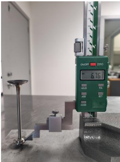
Figure 2: Intake Valve

Figures 2 (Intake) & 3 (Exhaust) : Measuring from the valve tip to the underside of the retainer using a height gauge