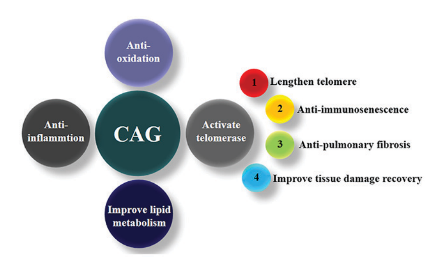
Figure 2. Pharmacological effects of CAG. CAG, cycloastragenol.

fibrosis and suppression of senescence in cells are dependent on telomerase activation. Further, data suggest that the mechanisms associated with the protective effects of CAG against bleomycin-induced lung fibrosis involve specific types of lung cells rather than all cell types in the lung (7). The mechanisms by which CAG works in specific cell types are likely related to the basic cellular proliferative ability; however, this issue has yet to be resolved.